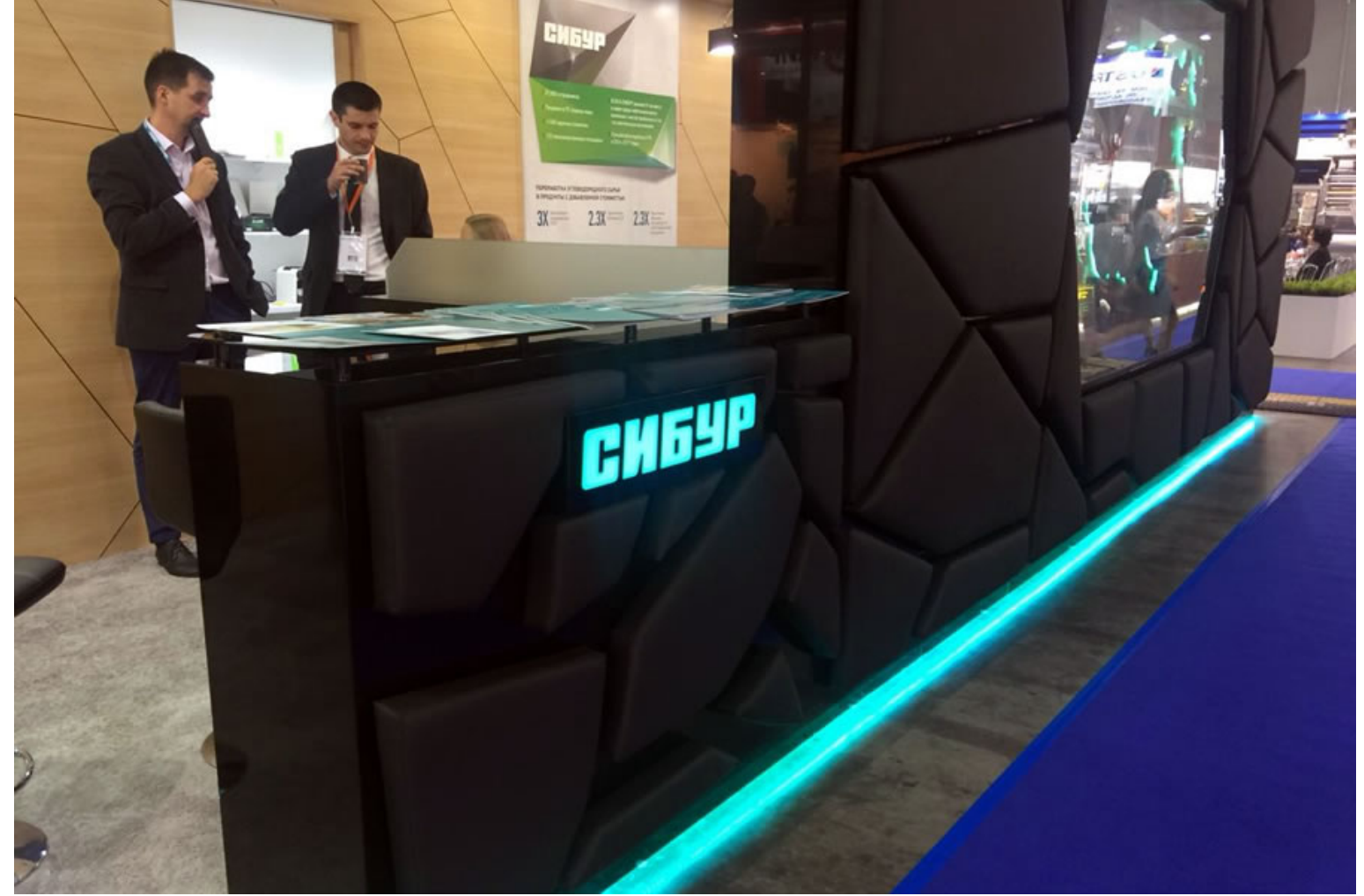
SIBUR's exhibition stand. RosUpack participants.