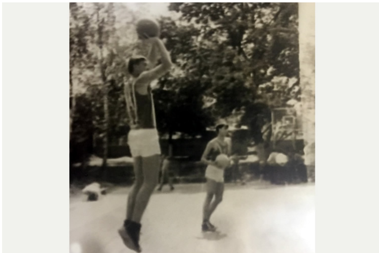
1967. The Voronezh Region basketball team training.

I think sports is a perfect tool for self-assertion and self-discovery. There is a huge difference between individual and team sports though, the latter requiring, first and foremost, the ability to band together to achieve a common goal. Today, there are lots of team-building trainings, while in our time we had sports for that. You would ask, why basketball? Because I view it as an intellectual game, a game of successful people. For a long time, basketball was much more than a hobby for me, and giving it up was really painful. It took me an eternity to overcome my desire to play. At the same time, I was getting more and more involved in my professional life.