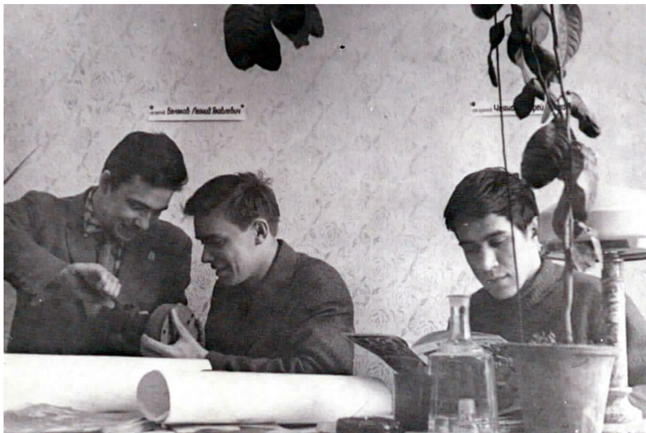
1963. A student at the Voronezh Technology Institute.

Though I have worked my entire life in the petrochemical industry, I cannot say I have chosen this path since I was at school. At that time, I played basketball a lot, and like my friends planned to get a degree in physical training. But our parents said a firm no, and we chose the Voronezh State University of Engineering Technologies (formerly the Voronezh Technology Institute) instead. I graduated from it as a specialist in chemical machinery and equipment. This is how petrochemistry became my lifelong ambition.