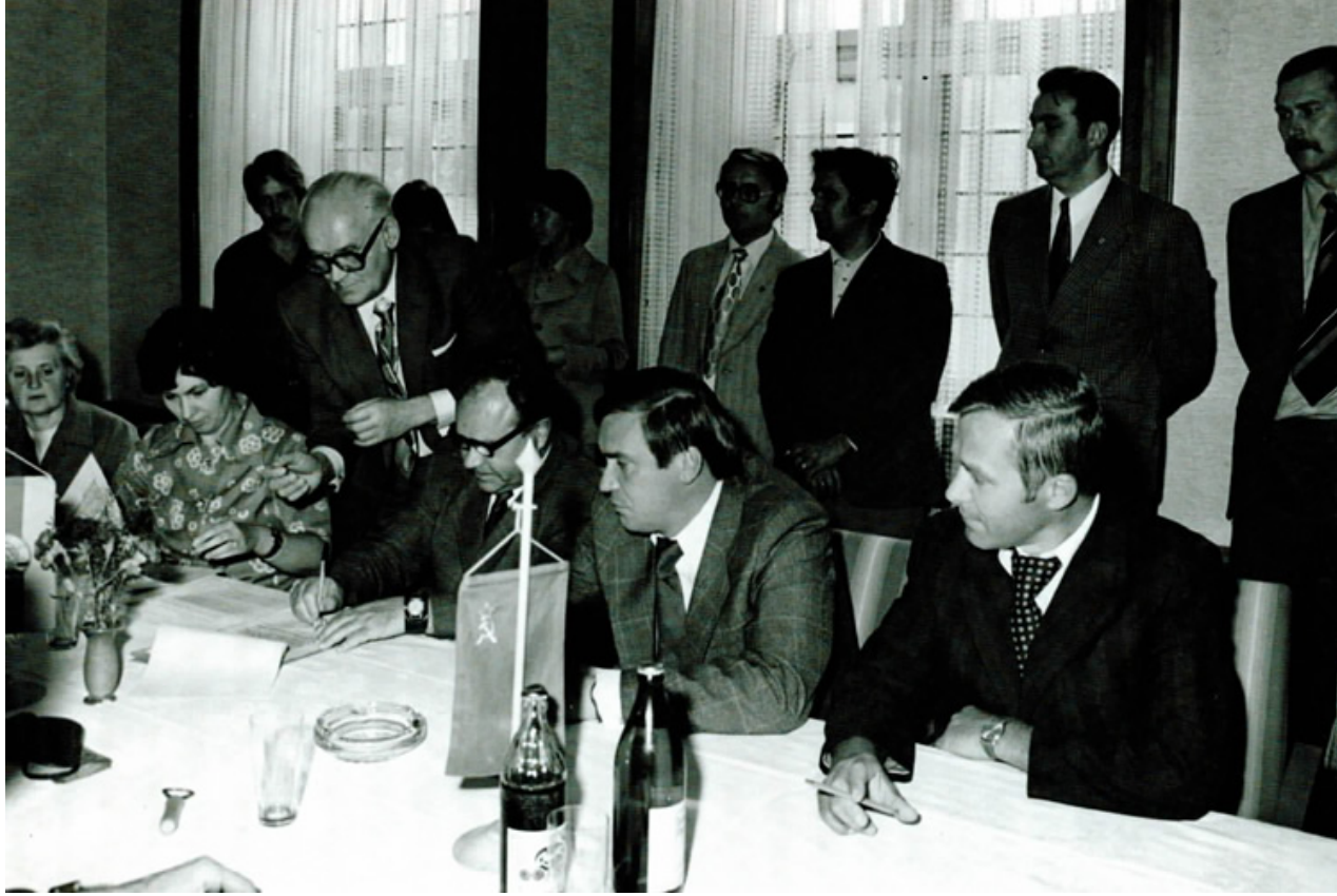
1978. Negotiations at the Buna Chemical Works, the German Democratic Republic.