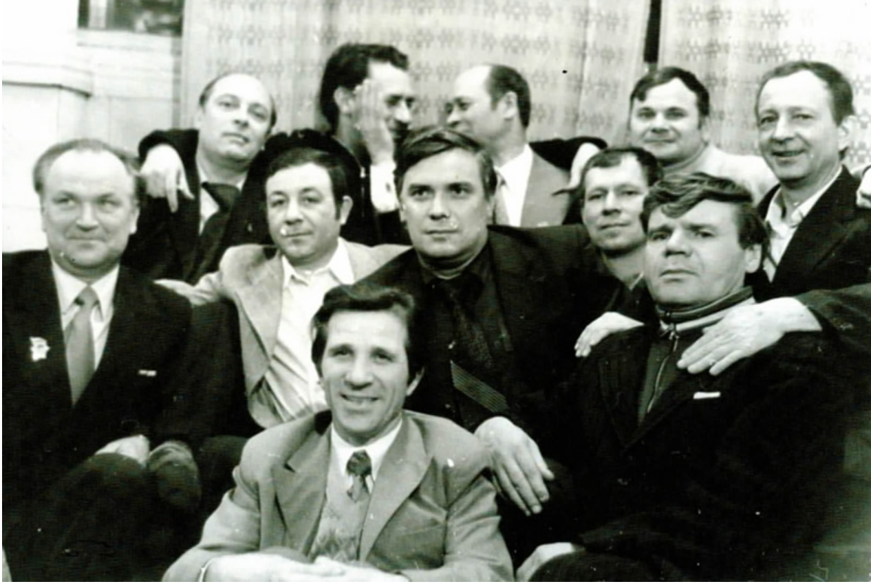
1978. The Voronezh Synthetic Rubber Plant (now Voronezhskintezkauchuk), Shop No. 28. A photo with a repair service team.