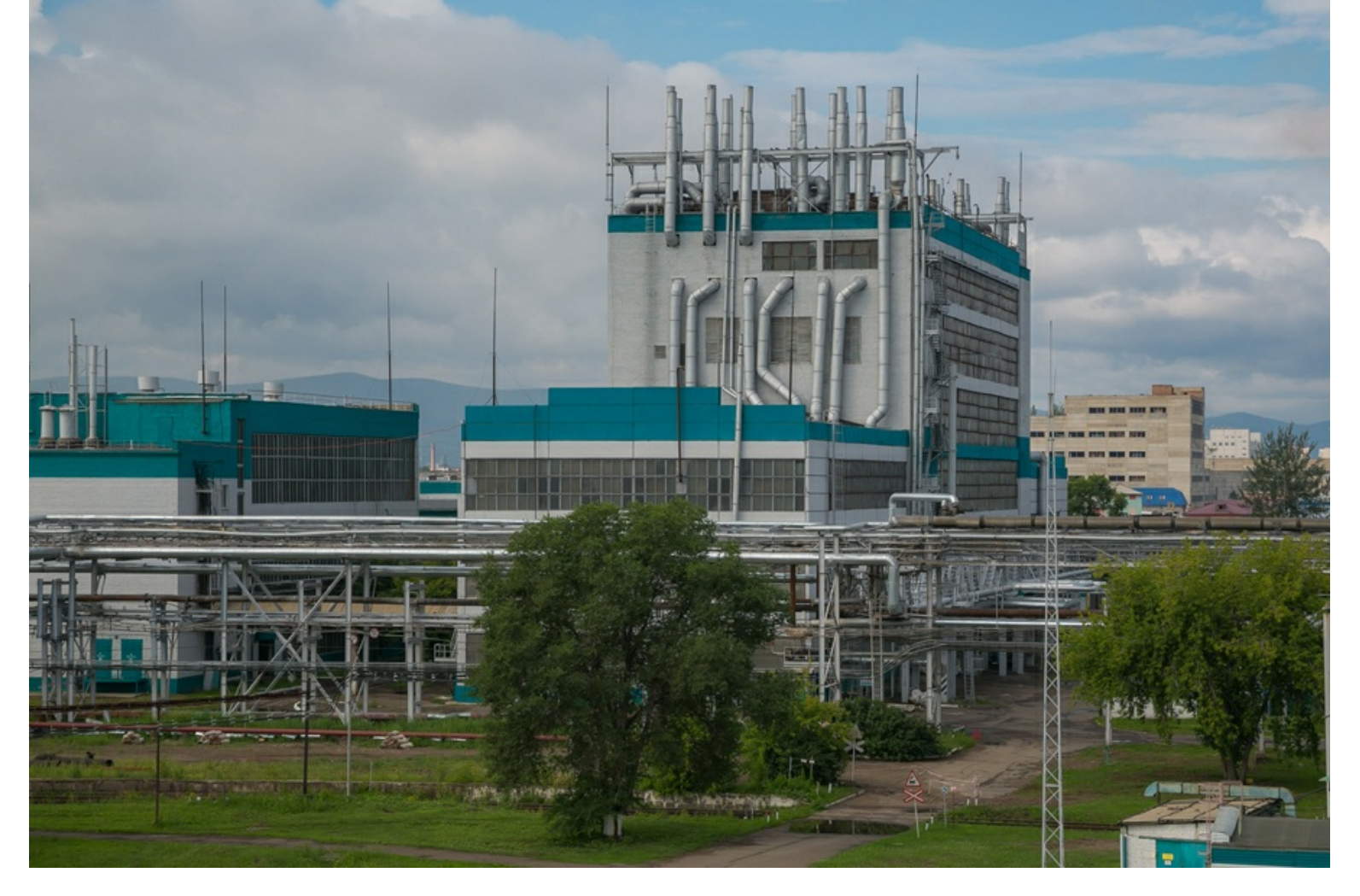
SIBUR's Krasnoyarsk site (KSRP), Russia's largest producer of high-quality nitrile-butadiene rubbers.

In autumn 2019, SIBUR and Sinopec signed a term sheet for the production of SEBS (styrene, ethylene and butylene-based block copolymers): the companies will establish a 50/50 joint venture (JV) in Russia to produce at least 20 ktpa of SEBS.