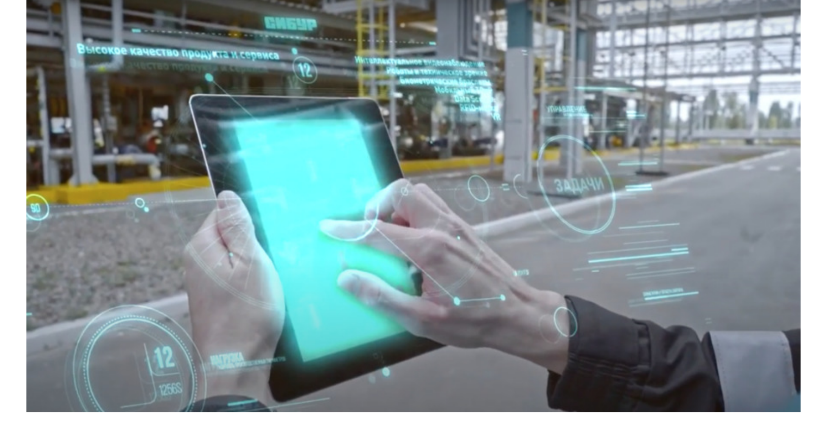
SIBUR's digital factory (project) concept visualised.

In late 2017, SIBUR announced digital transformation. The Company masters data management technologies, advanced analytics, the industrial Internet of things, augmented reality (AR) technologies, drones, etc. This also helped SIBUR quickly transition some of its employees to the home office during the coronavirus outbreak. Though, the Company underlines that it is at the starting point yet. Targeted innovations will then be followed by digitalisation of end-to-end management and production processes.