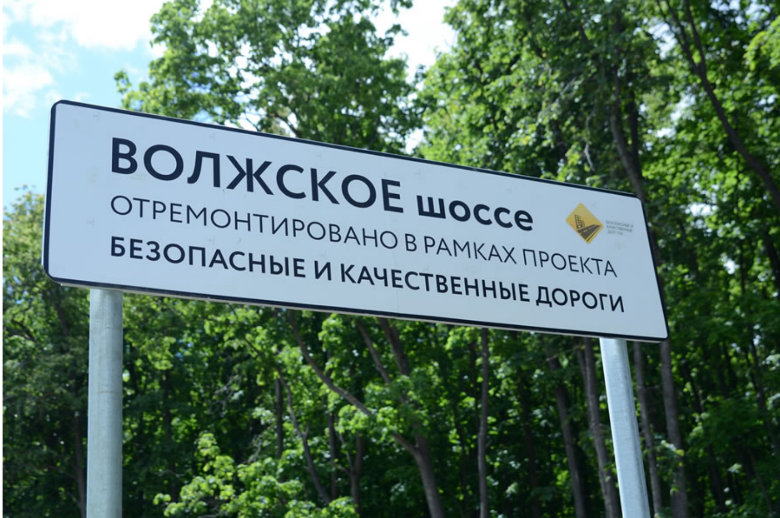
Volzhskoye Highway in Samara was repaired under the Safe and High-Quality Roads project Source: http://bkdrf.ru ( http://bkdrf.ru ).

PBBS FEATURE HIGH ELASTICITY AND THERMAL RESISTANCE, AND PAVEMENTS BASED ON PBBS HAVE INCREASED RUTTING RESISTANCE. ALL THIS REDUCES THE PAVEMENT MAINTENANCE EXPENSES ALMOST BY HALF, WHILE SIGNIFICANTLY INCREASING TRAFFIC SAFETY AND ROAD CAPACITY.