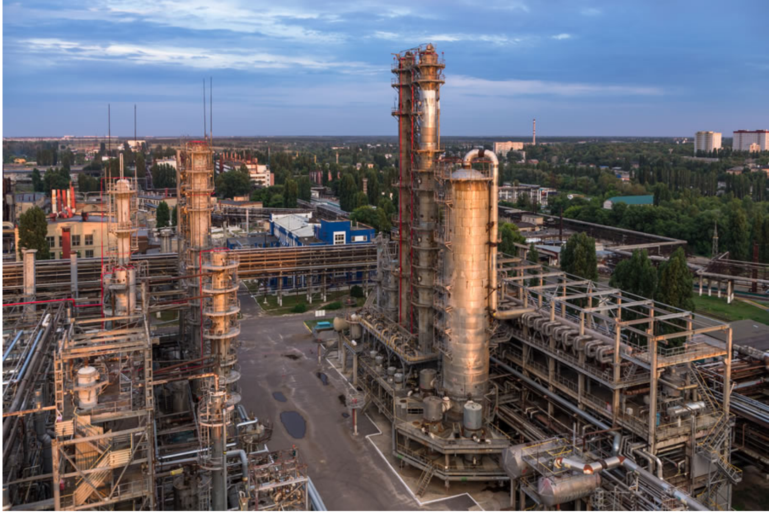
SIBUR's Voronezh site.

According to expert forecasts, consumption of TPE in the road construction segment has a growth potential of 7–10% per year, driven mainly by Russian President Vladimir Putin's so-called May decrees about increasing road lifetime and the Government's position on the quality of federal highways.