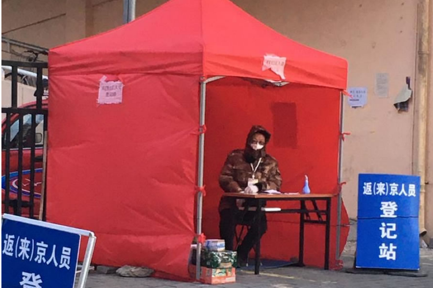
Residential district entrance.

OFFICE BUILDINGS IMPOSE VERY STRICT CONTROL WITH EVERY ENTRANT HAVING TO FILL OUT THE SO-CALLED HEALTH SURVEY.