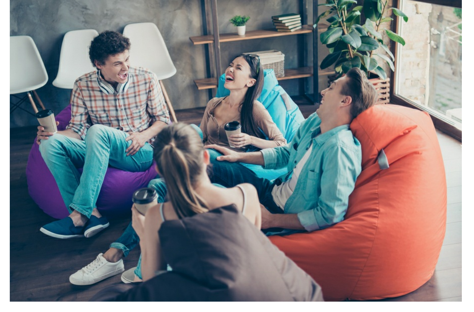
Remote teams also require informal team-building sessions.

IN ADDITION TO IMPLEMENTING NEW WORK PRINCIPLES, TAKE TIME TO SEE HOW THE TEAM REACTS, AND ADJUST THE APPROACH OR FIND A NEW ONE, IF NEED BE.