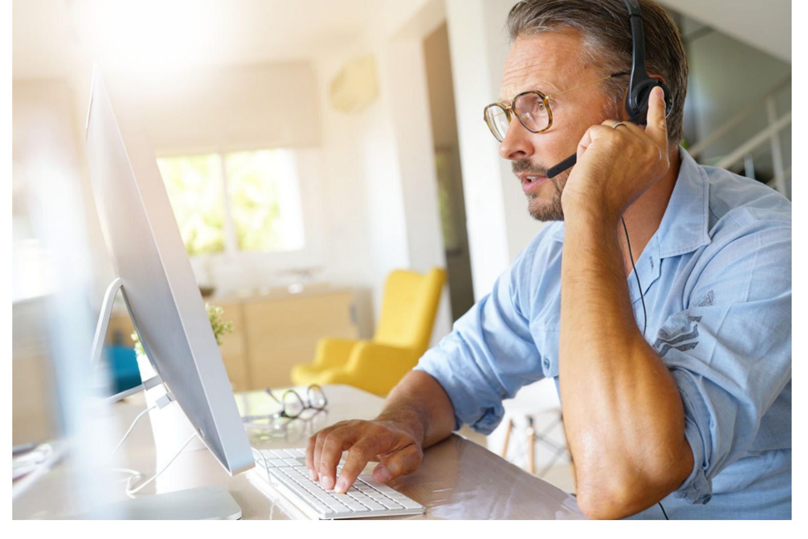
The manager has to find the right approach to each member of the remote team.

THERE ARE CULTURAL PATTERNS REMAINING UNCHANGED FOR DECADES. THE SMART THING TO DO IS TO USE THE TEAM'S CULTURAL DIVERSITY FOR THE BENEFIT OF THE BUSINESS.