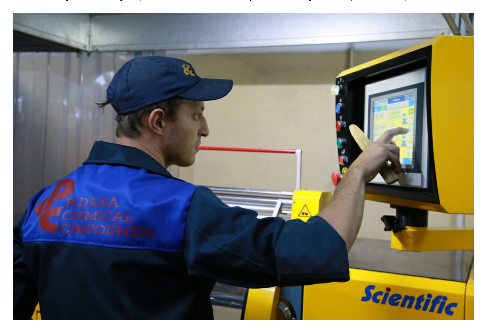
Padana Chemical Compounds' laboratory is fitted with high-tech equipment.

- We have resolutely abandoned the common view that we should create products whose quality matches the low price agreed with the customer. It is vitally important for us to produce products that meet current standards and are tailored to the client's needs in terms of quality and technology. Our R&D laboratory, led by an experienced Italian specialist with a 35-year track record at multinational companies in this sector, develops and implements a wide range of specialty grade compounds for various applications with a high level of efficiency. We are particularly focused on compounds used in the automotive, food and medical industries. The expert technical service that our specialists provide to our customers helps them to become well-versed in how to process specialty grades of PVC, and to solve a range of technological problems. What's more, many of our clients go on to export their own products.