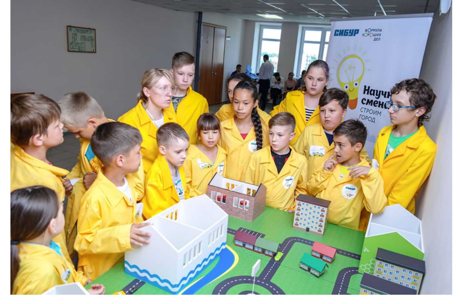
Science camps, the project for schoolchildren ages 9–13, is supported by SIBUR as part of the Formula for Good Deeds programme.

As part of the Society and Partnership goals, the Company is to establish a public council under the Formula for Good Deeds programme, launch at least three long-term environmental projects as part of this programme, and increase the share of employees participating in volunteering and other socially important initiatives to 20%. In addition, the Company aims to provide training in sustainable development for 85% of its employees and establish at least two international partnerships to promote sustainability.