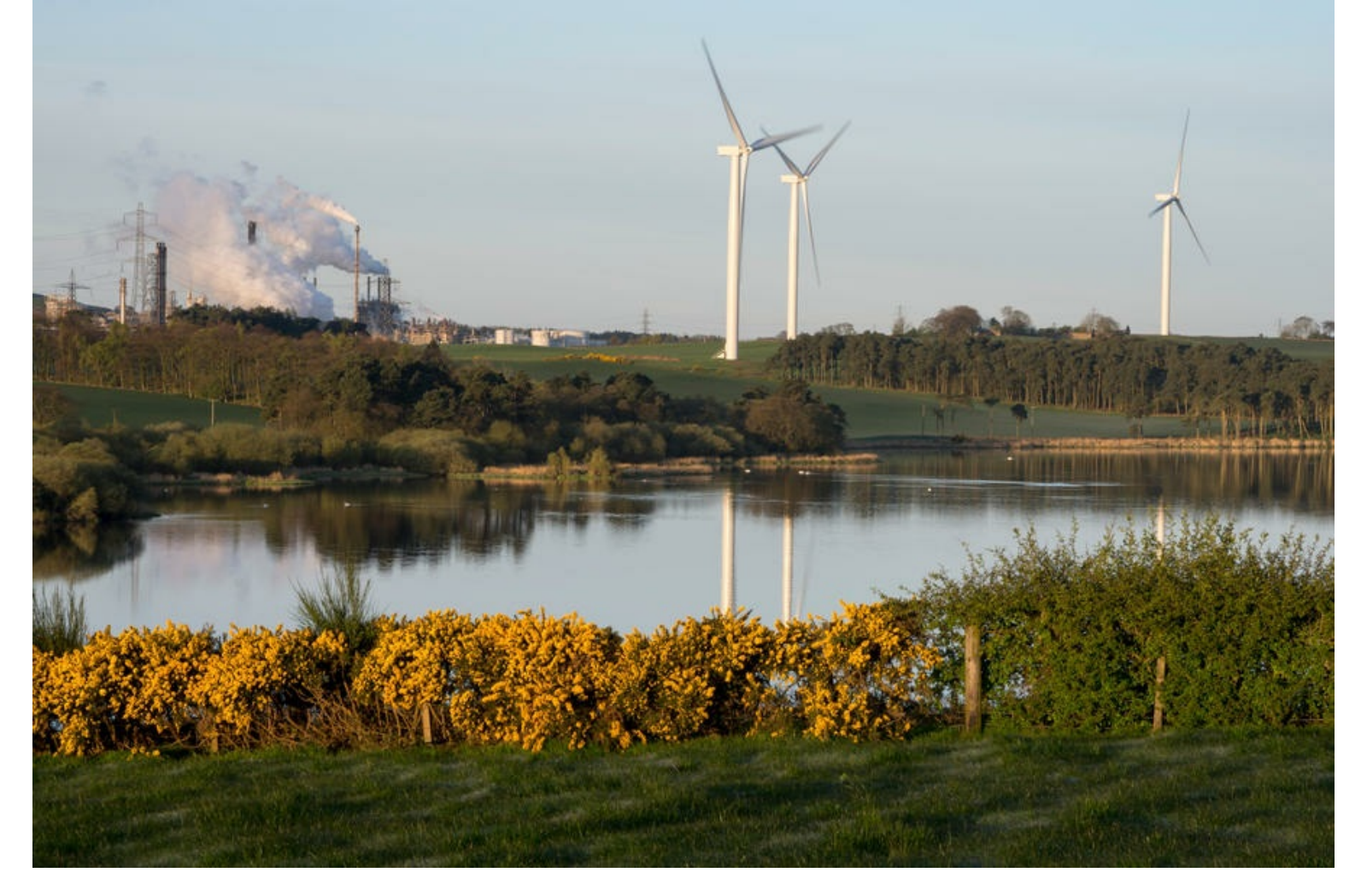
ExxonMobil Chemical's ethylene plant and Airvolution Energy's wind turbines, Scotland.