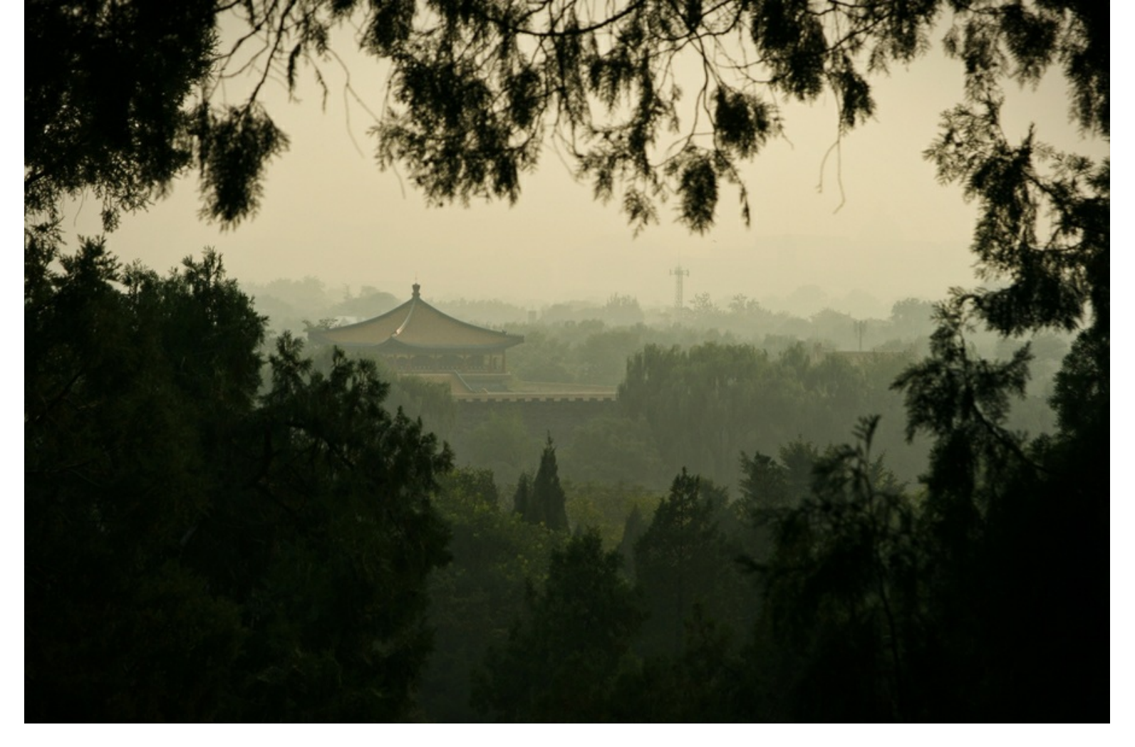
Smoggy sunset over Beijing.

ESG-CONSCIOUS BUSINESSES AREBY APPLYING ESG STANDARDS, COMPANIES ARE ABLE TO TAP INTO NEW MARKETS AND SHORE UP THEIR EXISTING POSITIONS, WHILE ALSO CHANGING CUSTOMER PERCEPTION (PEOPLE ARE WILLING TO PAY MORE FOR "ENVIRONMENTAL FRIENDLINESS").