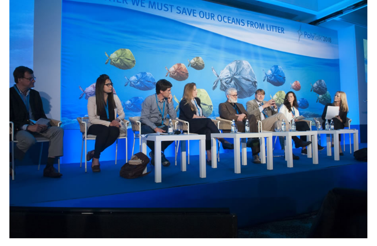
PolyTalk is PlasticsEurope's major stakeholder event.