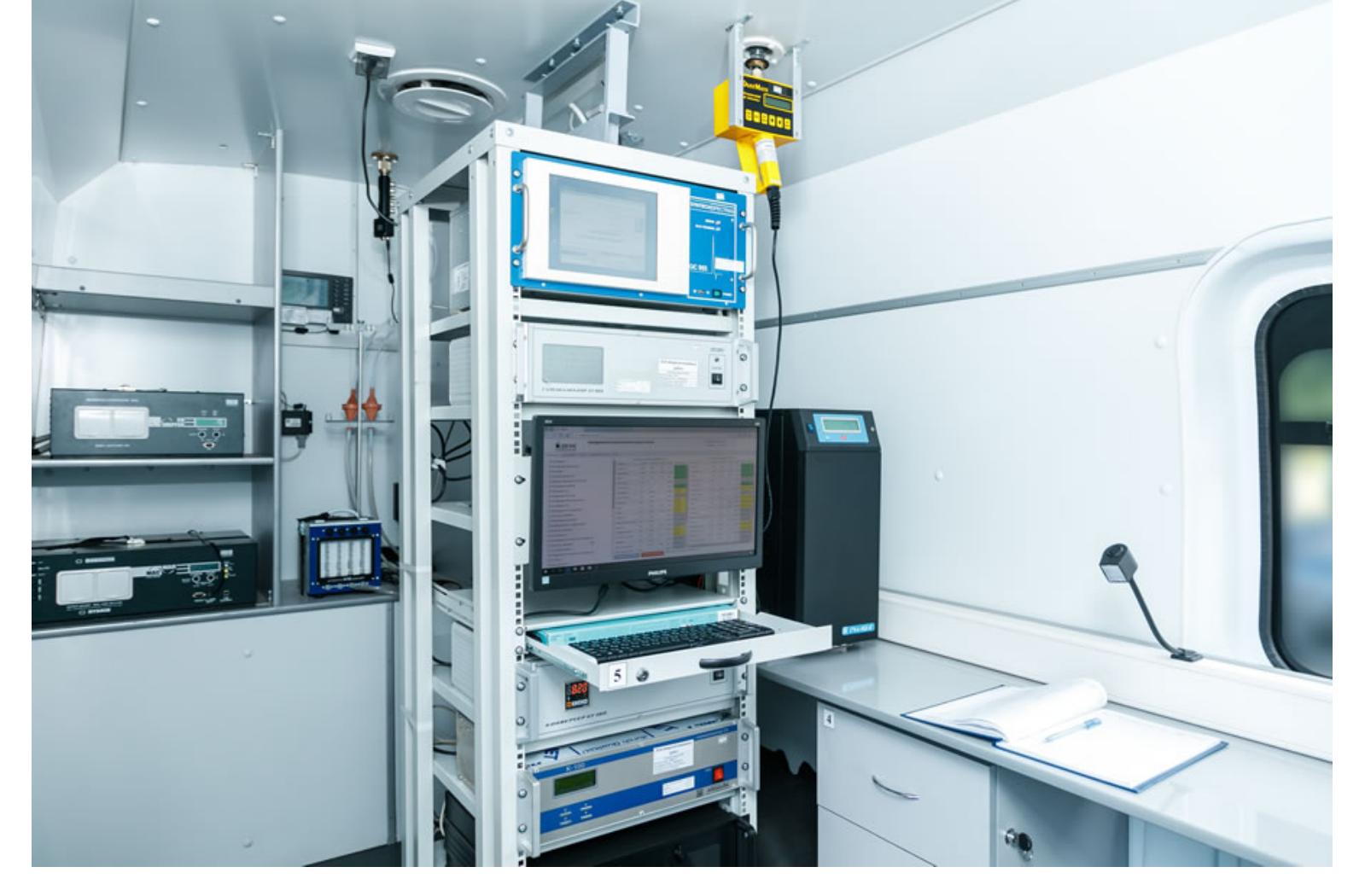
Voronezhsintezkauchuk, a mobile environmental lab at SIBUR's Voronezh site.

THE ESG PERFORMANCE OF THE RAEX RATING'S LEADERS WAS MORE THAN TWO TIMES AS GOOD AS THAT OF THEIR EUROPEAN PEERS, WITH THE FIRST THREE COMPANIES OF THE TOP 20 SPENDING AN AVERAGE OF 3.8% OF THEIR REVENUE ON ENVIRONMENTAL PROGRAMMES VS THE EU'S 1.5%.