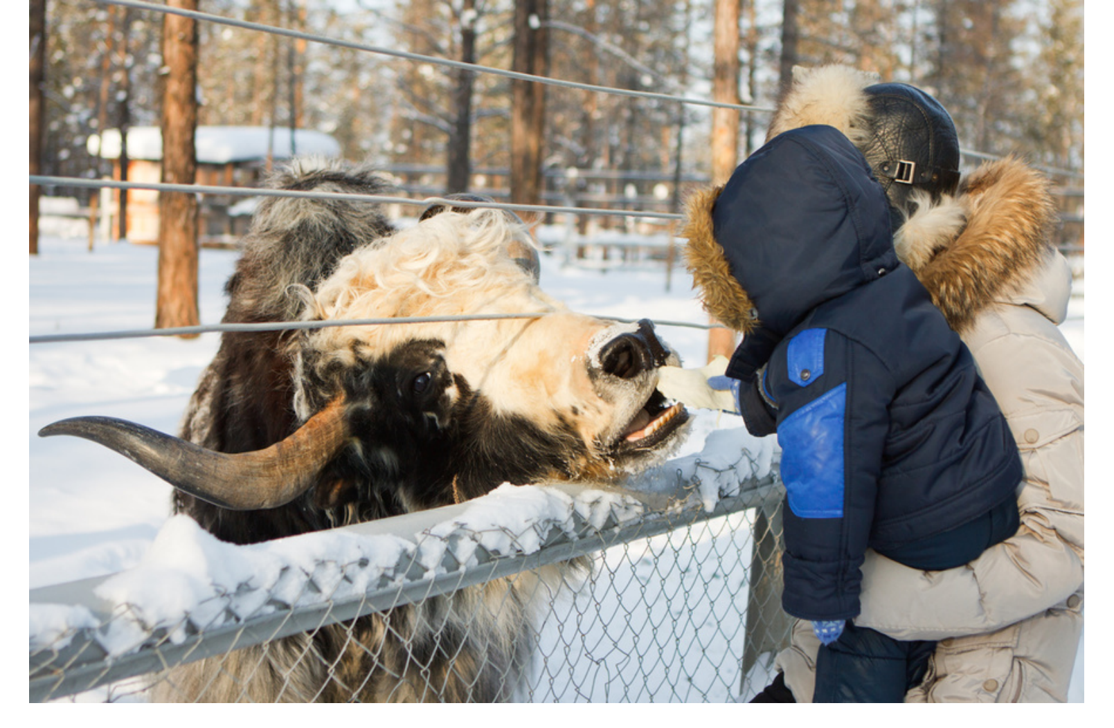
A child feeding a wisent in the Living Diamonds of Yakutia Park, which is actively supported by ALROSA.