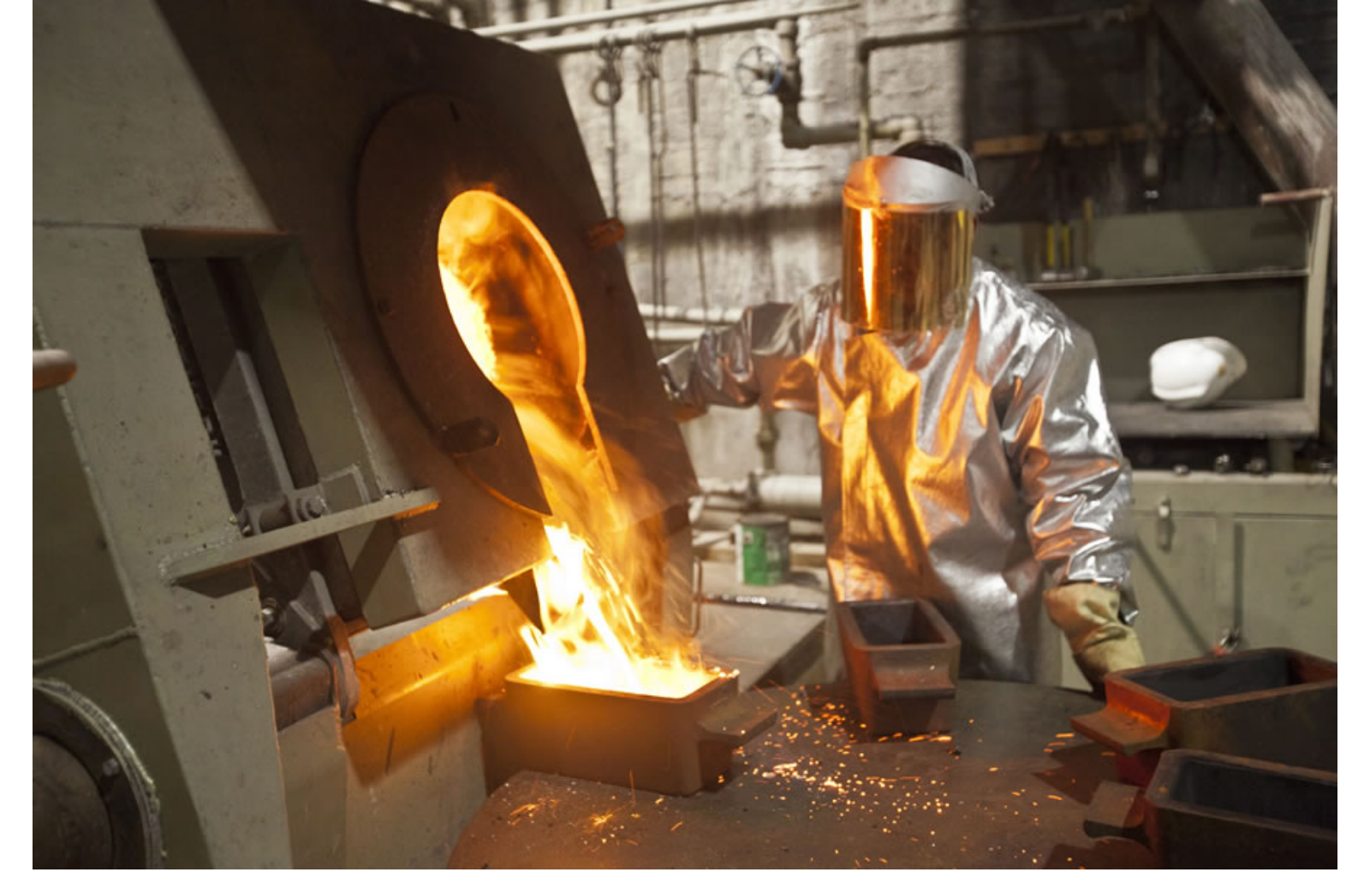
Metallurgical and mining companies were ESG pioneers. Photo: alloy production at the Kubaka processing plant

IN RUSSIA, ESG IS YET TO GAIN MOMENTUM, BUT AN INCREASING NUMBER OF FUNDS ARE FACTORING SUSTAINABILITY CRITERIA INTO THEIR INVESTMENT DECISIONS.