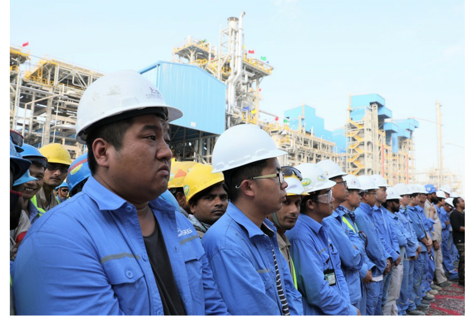
Chinese and expat employees of Sinopec Fifth Construction Co.

THE ESG APPROACH ENABLES COMPANIES TO RECRUIT AND RETAIN MORE EMPLOYEES, BOOST THEIR MOTIVATION AND INCREASE OVERALL PRODUCTIVITY.