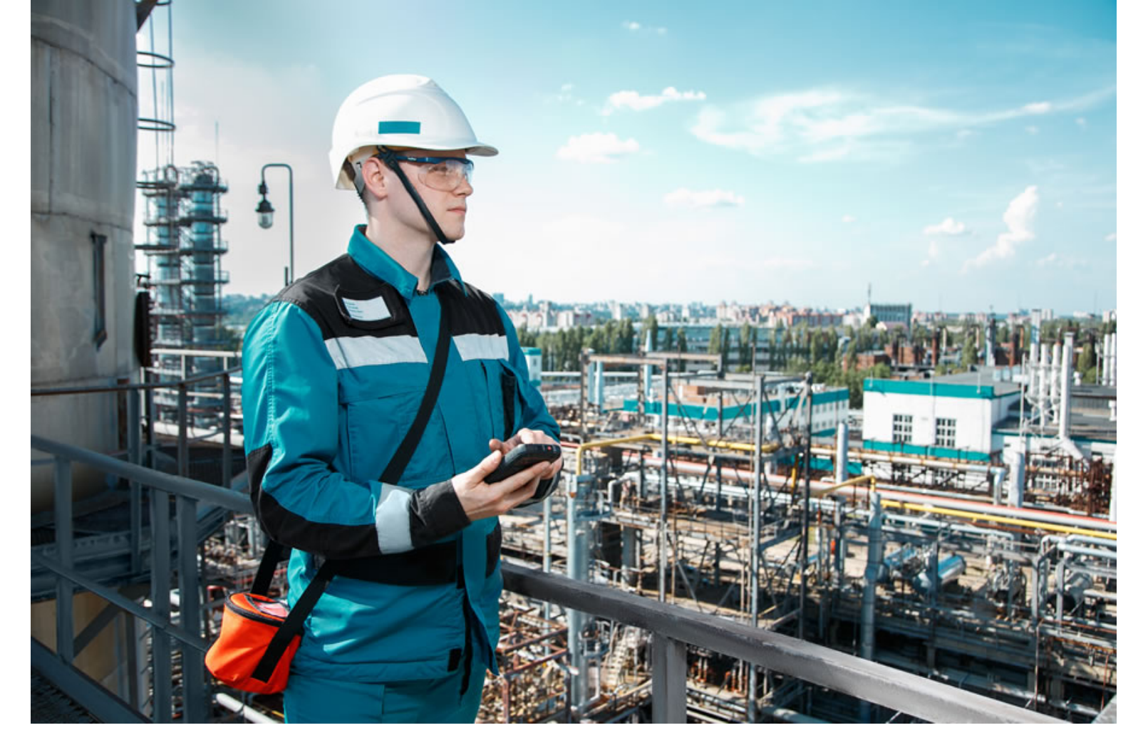
Employee safety is one of SIBUR's key priorities.

SOME 73% OF INVESTORS CONSIDER A HIGHER LEVEL OF SUSTAINABILITY MANAGEMENT AND OPERATIONAL EFFICIENCY A SERIOUS ENOUGH BASIS FOR THE INVESTMENT DECISION.