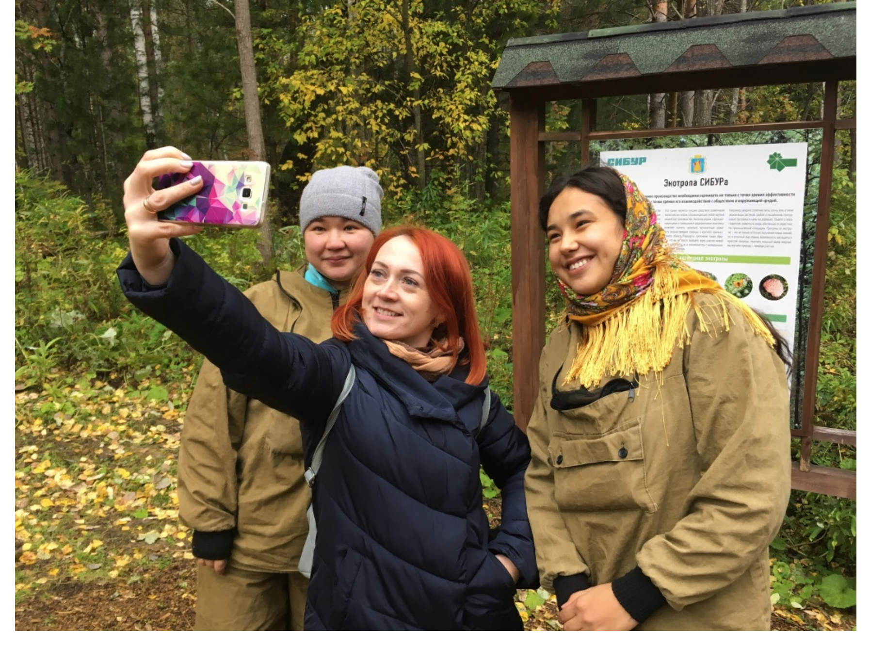
SIBUR's Nature Path allows experts from SIBUR and Tobolsk Integrated Research Station of RAS (Urals) to check the quality of the environment.

THE INSUFFICIENT AND INADEQUATE COLLECTION OF RECYCLABLES PLACES ADDITIONAL RESPONSIBILITY ON ALL PETROCHEMICAL INDUSTRY PLAYERS.