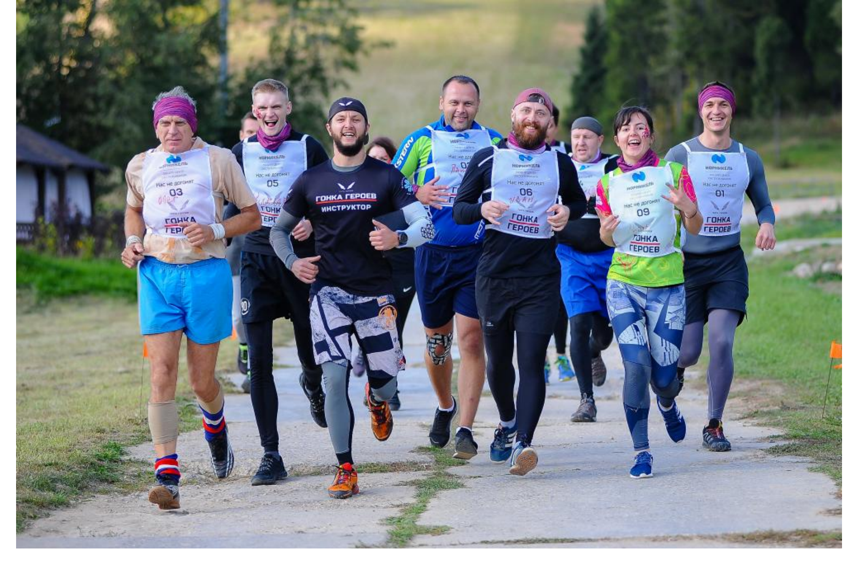
Norilsk Nickel implements not just environmental, but also various social programmes, including those that promote healthy lifestyle among employees.

FAST-GROWING GLOBAL PRODUCERS OF CONSUMER GOODS ARE STRONGLY URGING THEIR SUPPLIERS TO JOIN THE SUSTAINABLE DEVELOPMENT MOVEMENT.