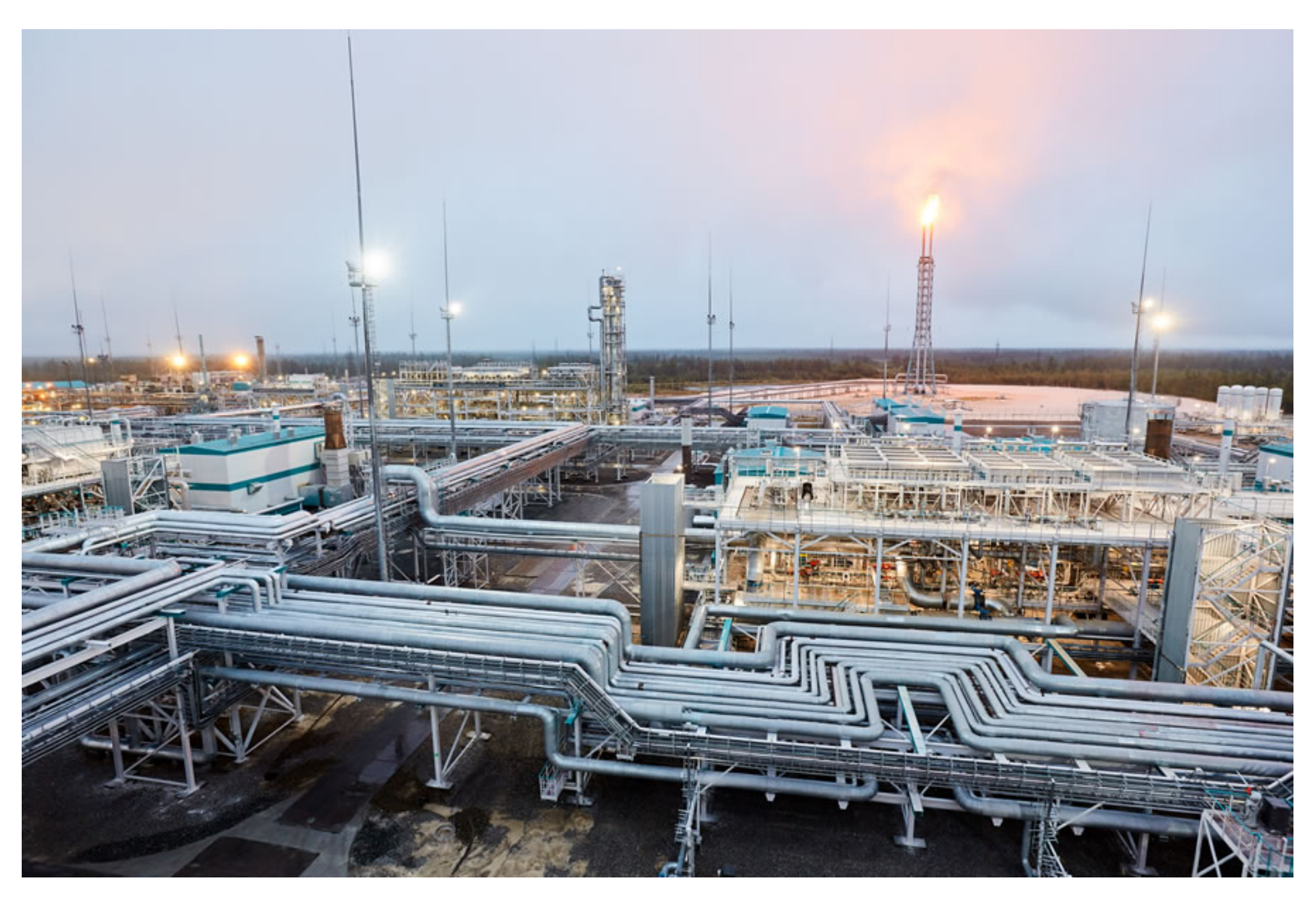
APG processing at the Vyngapurovsky Gas Processing Plant.

production with minimal environmental footprint, and positive environmental impact of SIBUR's products throughout their life cycle. However, the circular cycle has a big gap, which is the insufficient and inadequate collection of recyclables. This places additional responsibility on all industry players pushing them to seek ways to nudge the supply chain participants towards the circular economy.