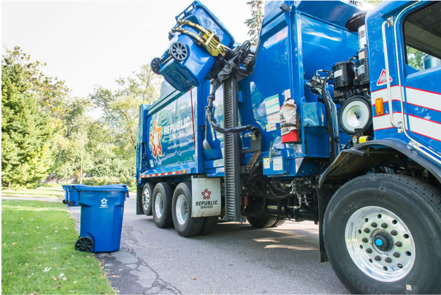
Republic Services, one of America's largest waste collection companies, has stopped accepting unsorted waste at its Memphis facility.

Other American waste management companies have registered an interest in new technologies in order to increase the efficiency of the recycling process. However, as a result, the cost of these services is increasing. Finnish authorities now pay 92USD per collection of 1 tonne of waste, compared with 44USD before the implementation of the Chinese ban.