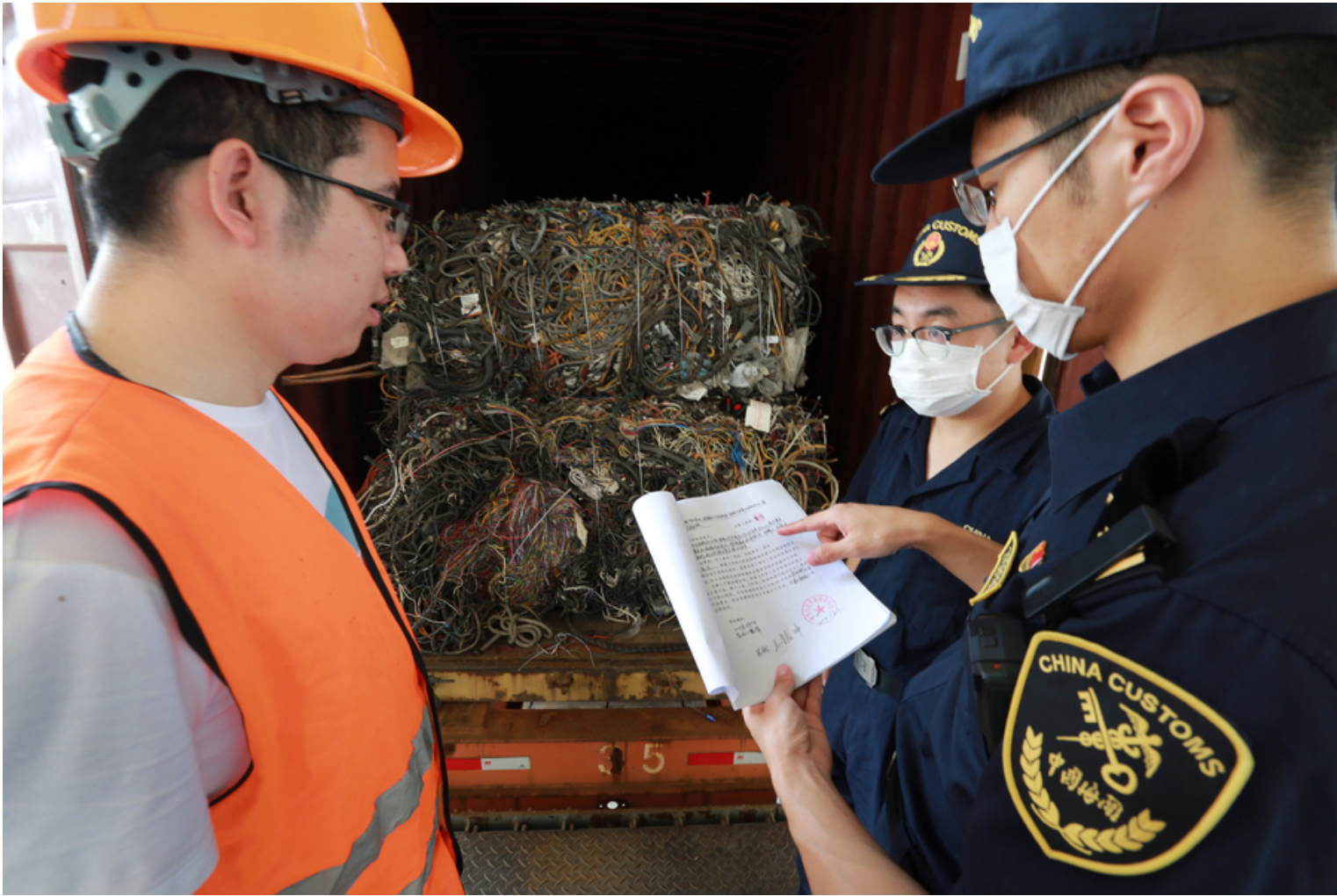
Chinese customs officers check a truck carrying imported solid waste.

Asei, a Japanese exporter of recycled plastics, has moved its production of plastic pallets from Shanghai to Japan, having built two new factories north-east of Tokyo.