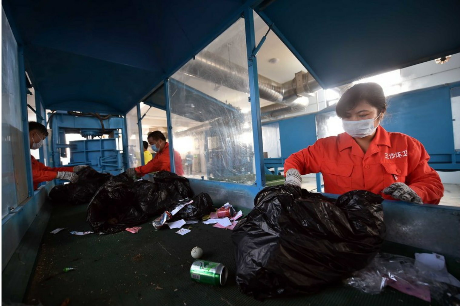
Workers sorting materials for recycling at a waste collection and transfer station in Changsha, China.

BP, COCA-COLA, DANONE, UNILEVER AND OTHER COMPANIES ARE INVESTING TENS OF MILLIONS OF DOLLARS IN CHEMICAL PLASTIC RECYCLING TECHNOLOGIES.