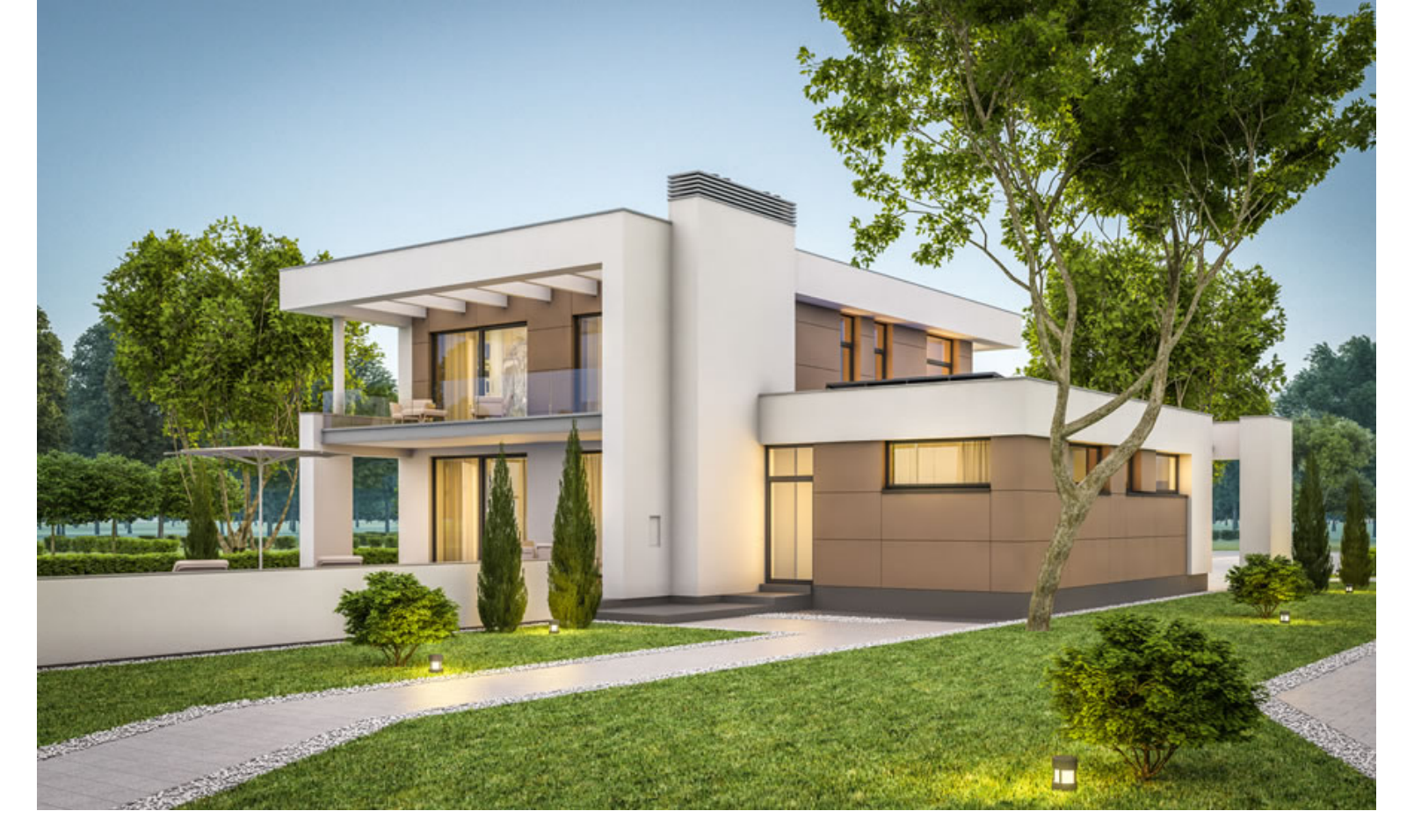
Articles posted on construction-related sites can be very efficient.

EXCEEDINGLY POPULAR ARE NON-PROFESSIONAL BITE-SIZED VIDEOS THAT ARE EASILY CONSUMABLE AND CONTAIN MINIMAL BRANDING.