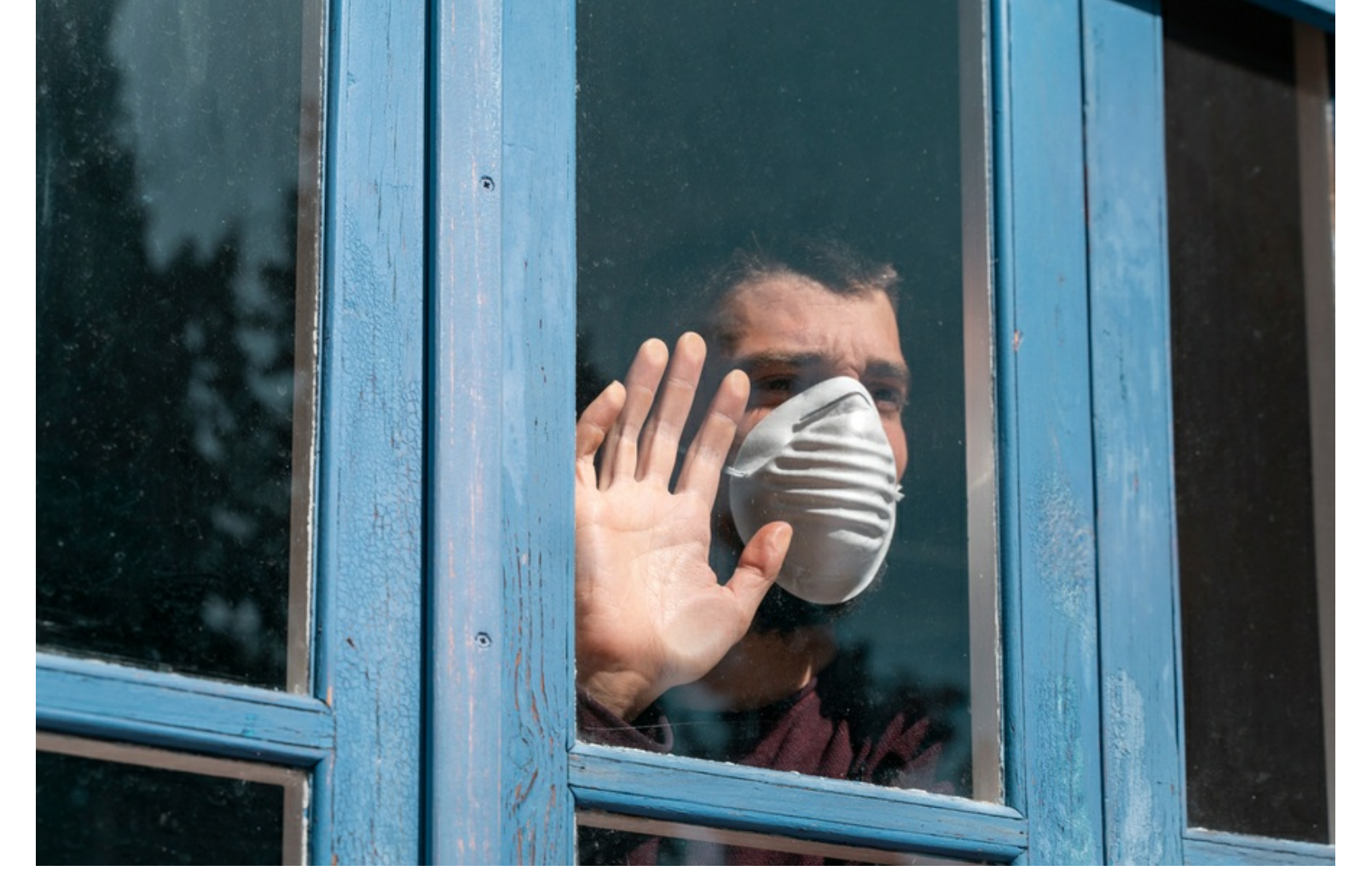
Isolation and disconnection both breed and exacerbate anxiety.

STRESS AND ANXIETY RESULT PHYSIOLOGICALLY FROM THE "FIGHT OR FLIGHT" – OR SYMPATHETIC NERVOUS SYSTEM – RESPONSE TRIGGERED BY CORTISOL AND NOREPINEPHRINE.