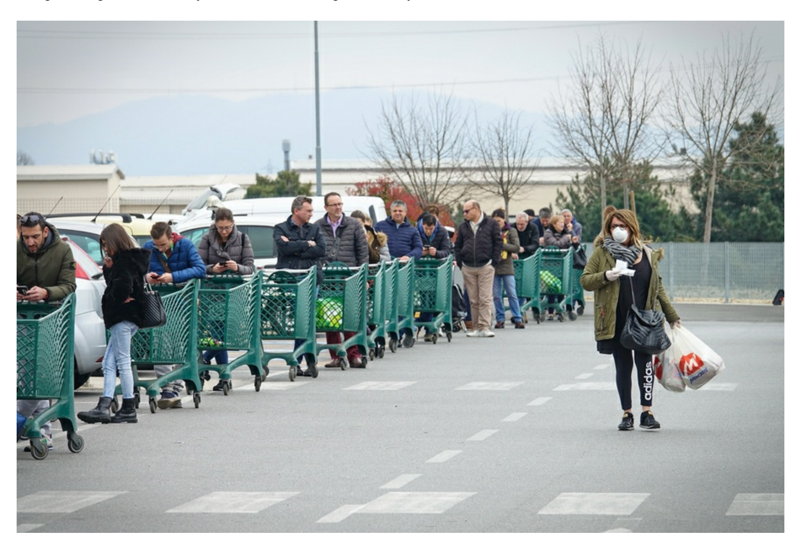
Long queue to enter the supermarket for grocery shopping. Milan, Italy.

Whether it seems the world has turned upside down, or your biggest stressor thus far is adjusting to working from home a few feet away from your partner, discomfort is a universal, natural, and – in many cases – healthy response to our current reality. As humans, we rely on an illusion of a predictable future to mitigate feelings of anxiety. It's from this illusion that we make plans and experience a sense of control. So, even if you're feeling relatively secure in your health, finances, and job at the moment, there's a collective sense of being "on edge" as we all adjust to this disorienting uncertainty.