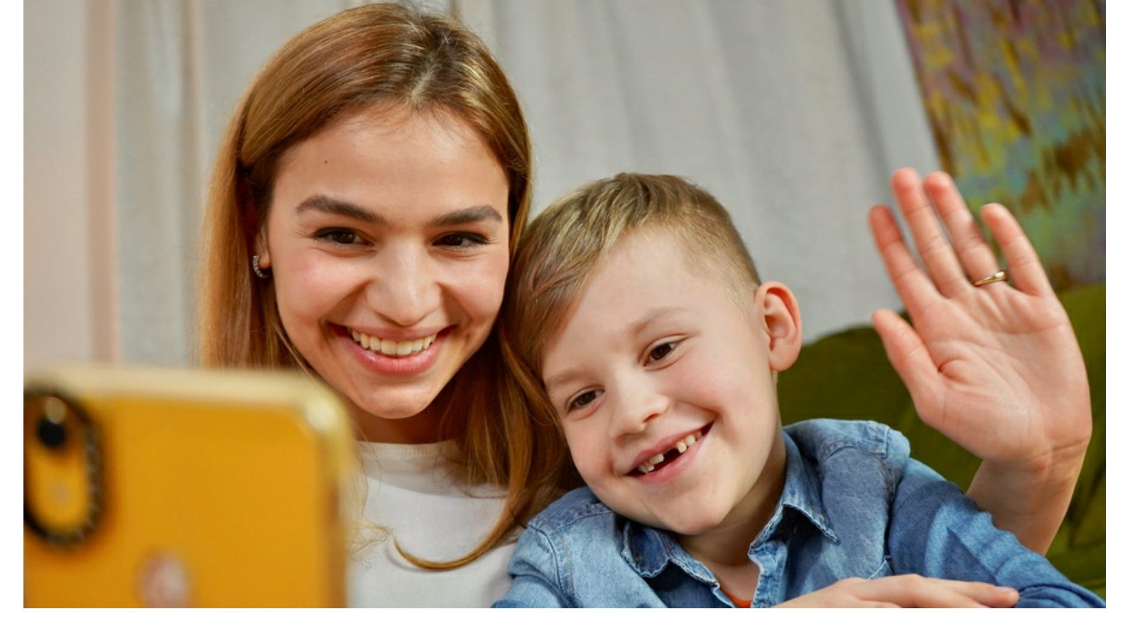
Remember when we used to call people on the telephone? Consider bringing it back.

MORE THAN EVER, WE NEED TO BE PROACTIVE AND INTENTIONAL IN OUR CONNECTION.