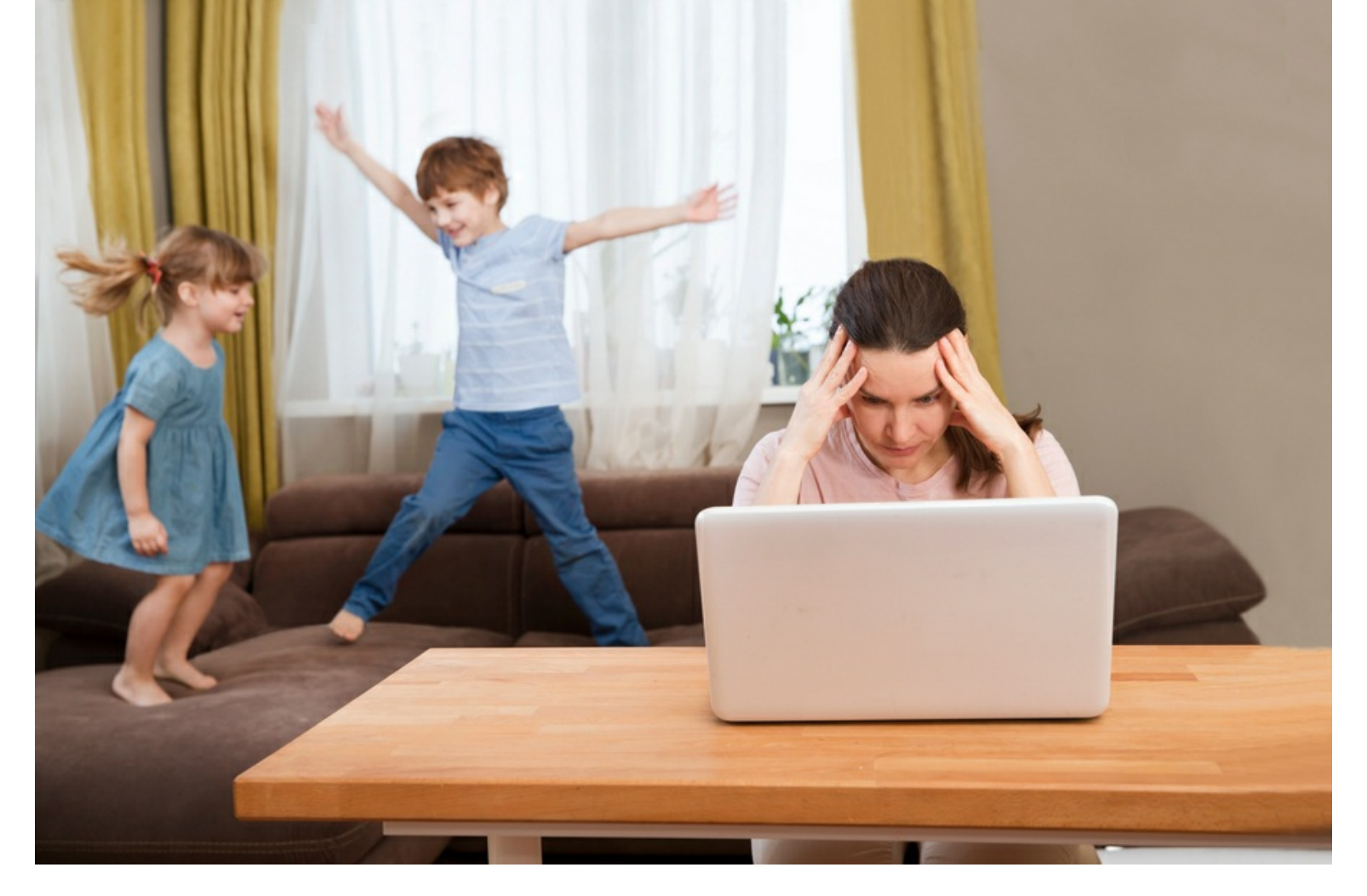
Countless individuals navigate this crisis while adjusting to their kids home from school.