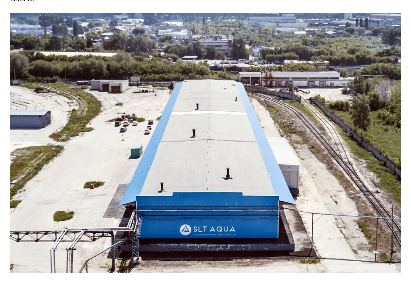
SLT AQUA's production site.

At the time we were choosing a location for our production site, the Togliattisintez Industrial Park had available areas meeting our criteria.