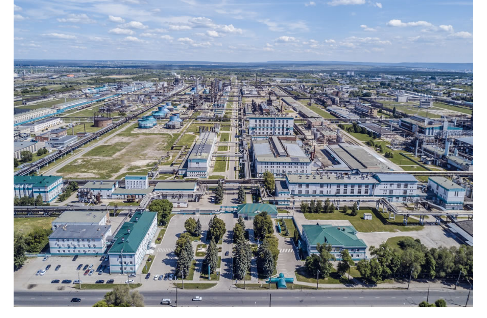
Togliattisintez Industrial Park.

IN THE NOT-SO-DISTANT PAST, PRICE USED TO BE THE DECISIVE FACTOR FOR CUSTOMERS IN OUR SEGMENT.