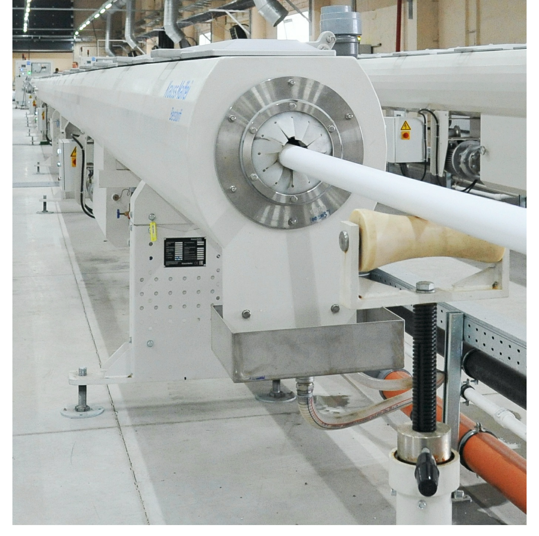
Producing polypropylene pipes.

THIS NO LONGER THE CASE, AS THE PRODUCT QUALITY IS NOW INCREASINGLY TAKING THE CENTRE STAGE.