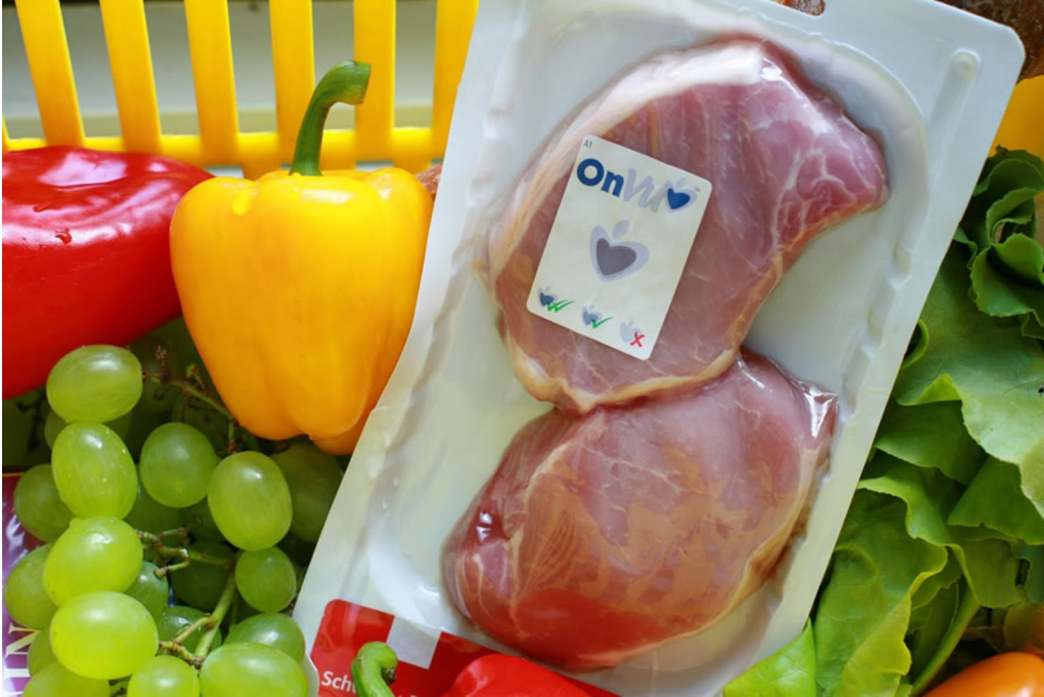
The time-temperature indicator from the German technology manufacturer Bizerba.

APART FROM EXTENDING PRODUCTS' SHELF LIFE, TOMORROW'S PACKAGING WILL BE ABLE TO ADVISE ON WHETHER THEY ARE STILL SAFE TO CONSUME.