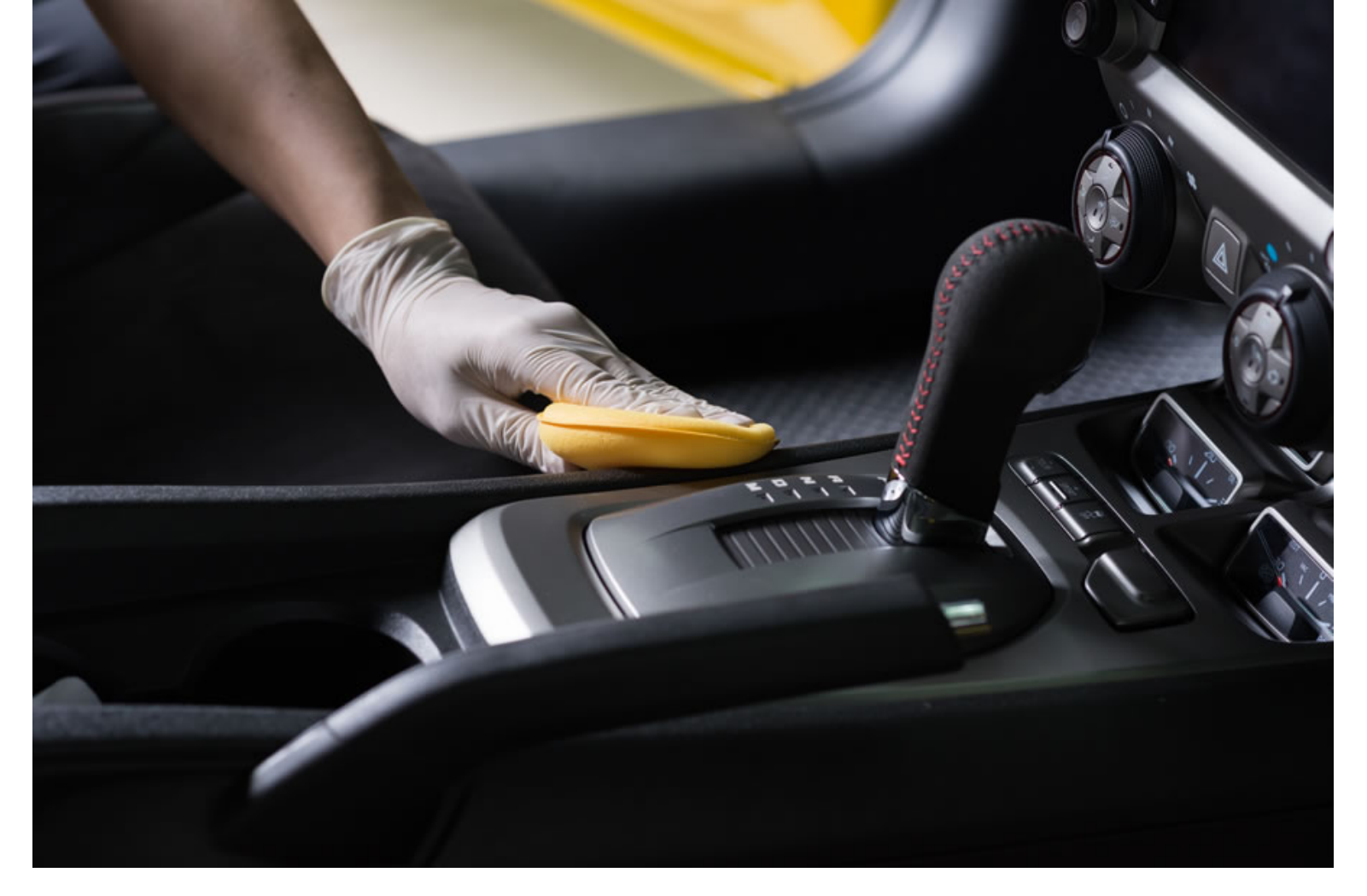
Close to 50% of all parts in modern cars are made of polymers.

FIGURING OUT HOW TO DISPOSE OF WASTE OR, IF POSSIBLE, REUSE IT IN THE ECONOMY TAKES SERIOUS RESEARCH.