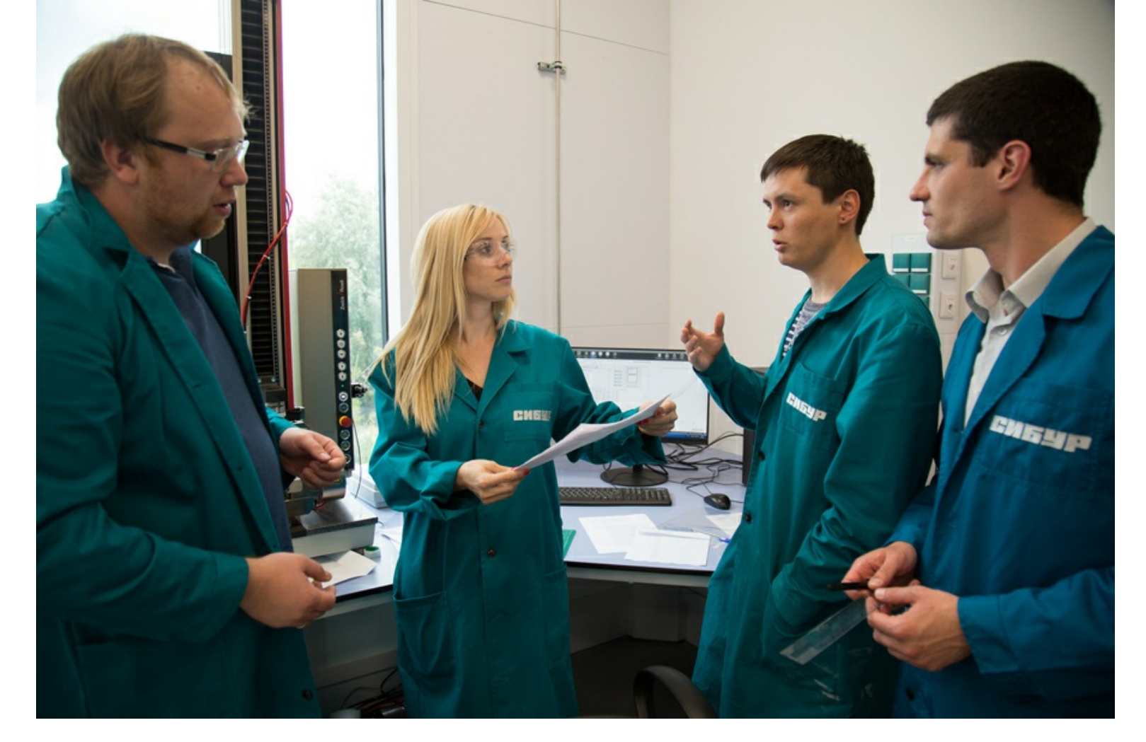
SIBUR PolyLab employees.