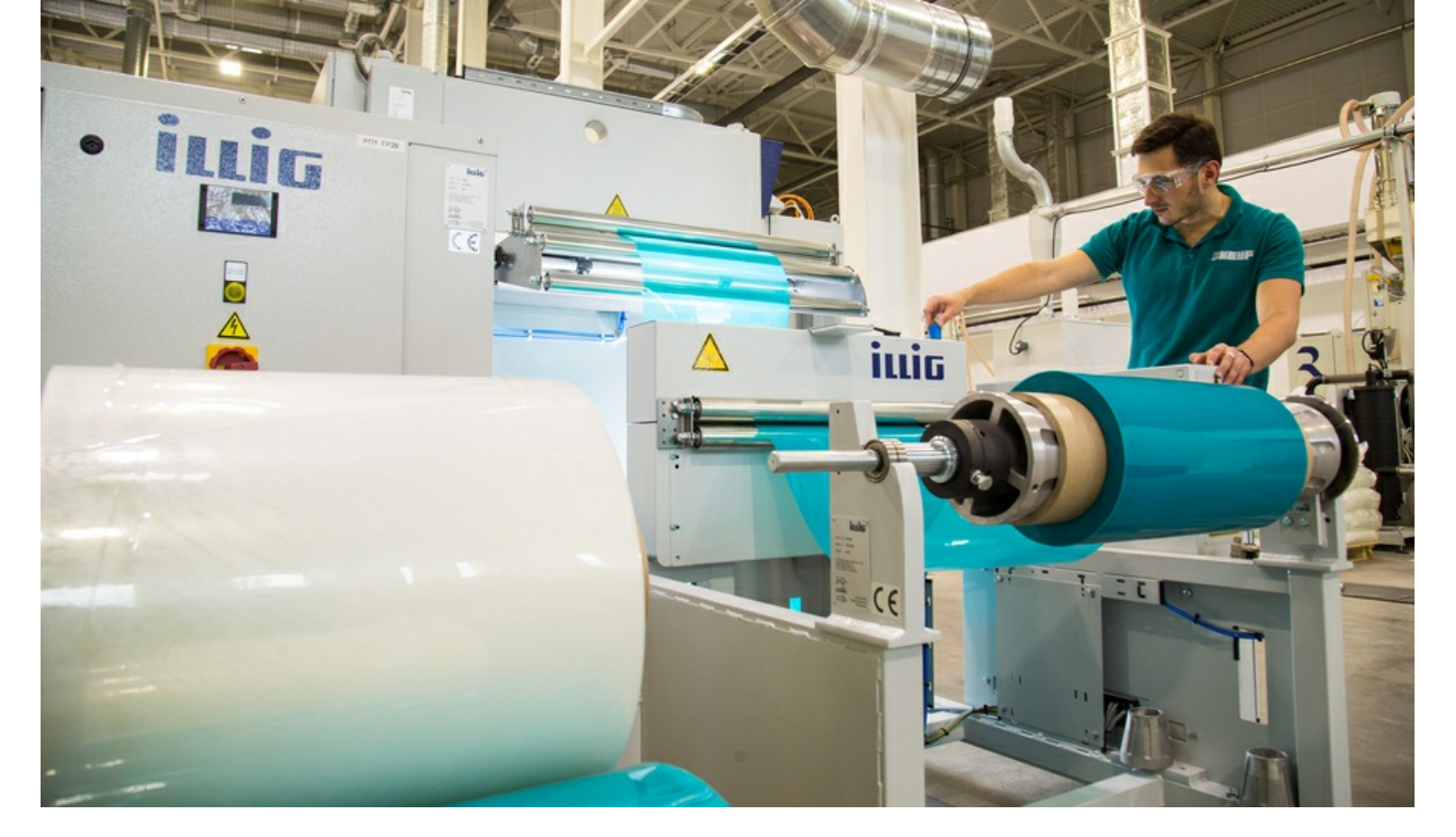
SIBUR PolyLab researchers working on new materials.

I WOULD NOT RULE OUT GOING MORE FUNDAMENTAL AS WE BUILD UP AND EXPAND OUR APPLIED RESEARCH EXPERTISE.