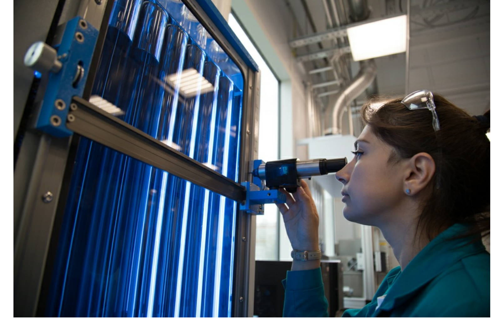
Researchers at SIBUR PolyLab develop new materials adapted to specific business needs.

IT MAY TAKE A DECADE TO DEVELOP A COMPLETELY NEW MOLECULE THAT HAS NEVER EXISTED BEFORE, WITH BASIC RESEARCH ALONE TAKING UP FIVE TO SEVEN YEARS.