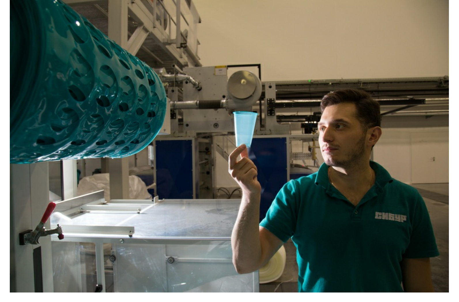
Creating highly recyclable polymers is a key task facing the researchers.