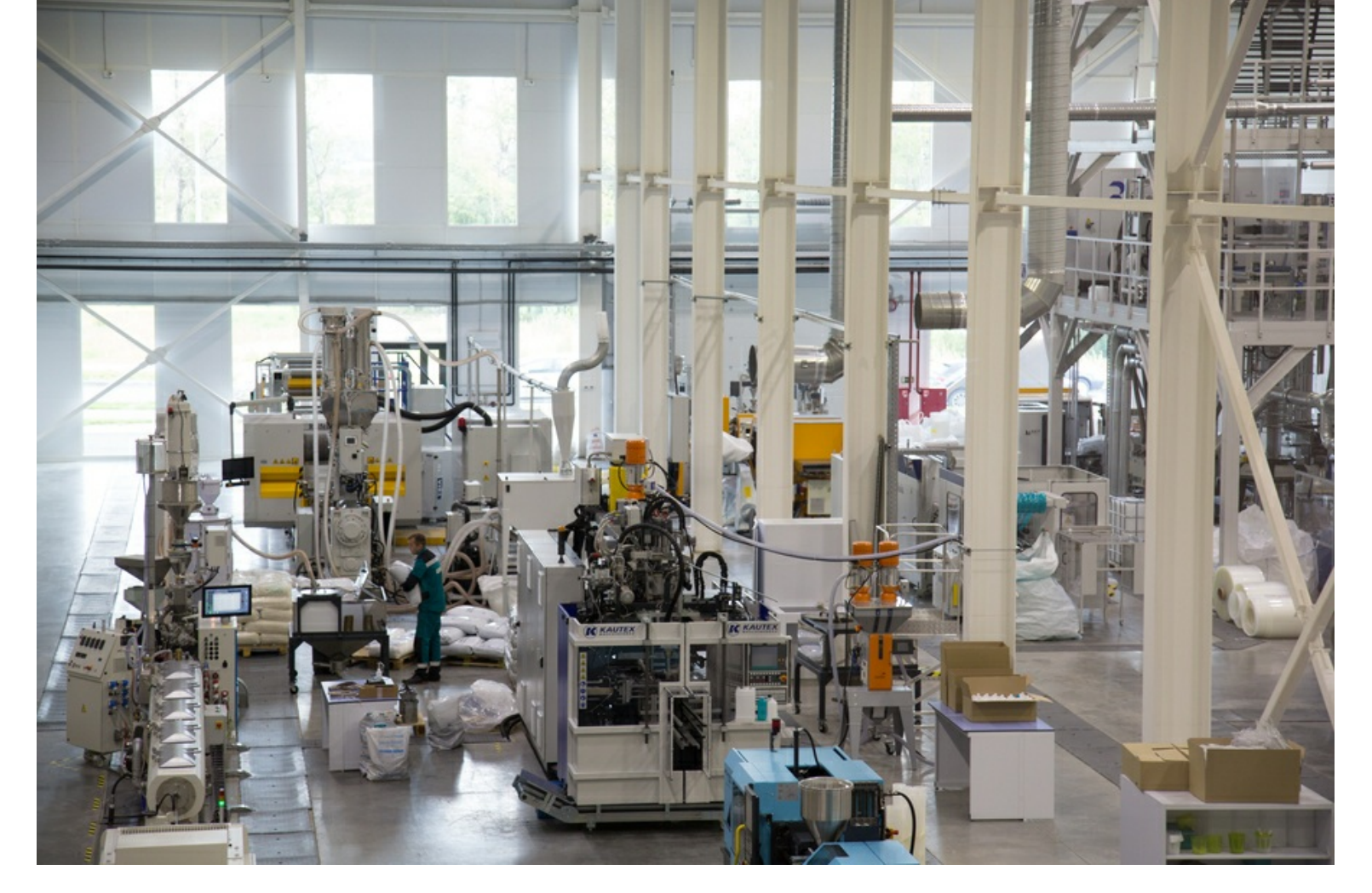
SIBUR PolyLab R&D centre.

WE IDENTIFY AREAS IN WHICH PURE SCIENCE IS MORE LIKELY TO EVOLVE INTO APPLIED RESEARCH, WORKING WITH OUR PARTNERS FROM THE ACADEMIC COMMUNITY TO ACCOMPLISH THIS TASK.