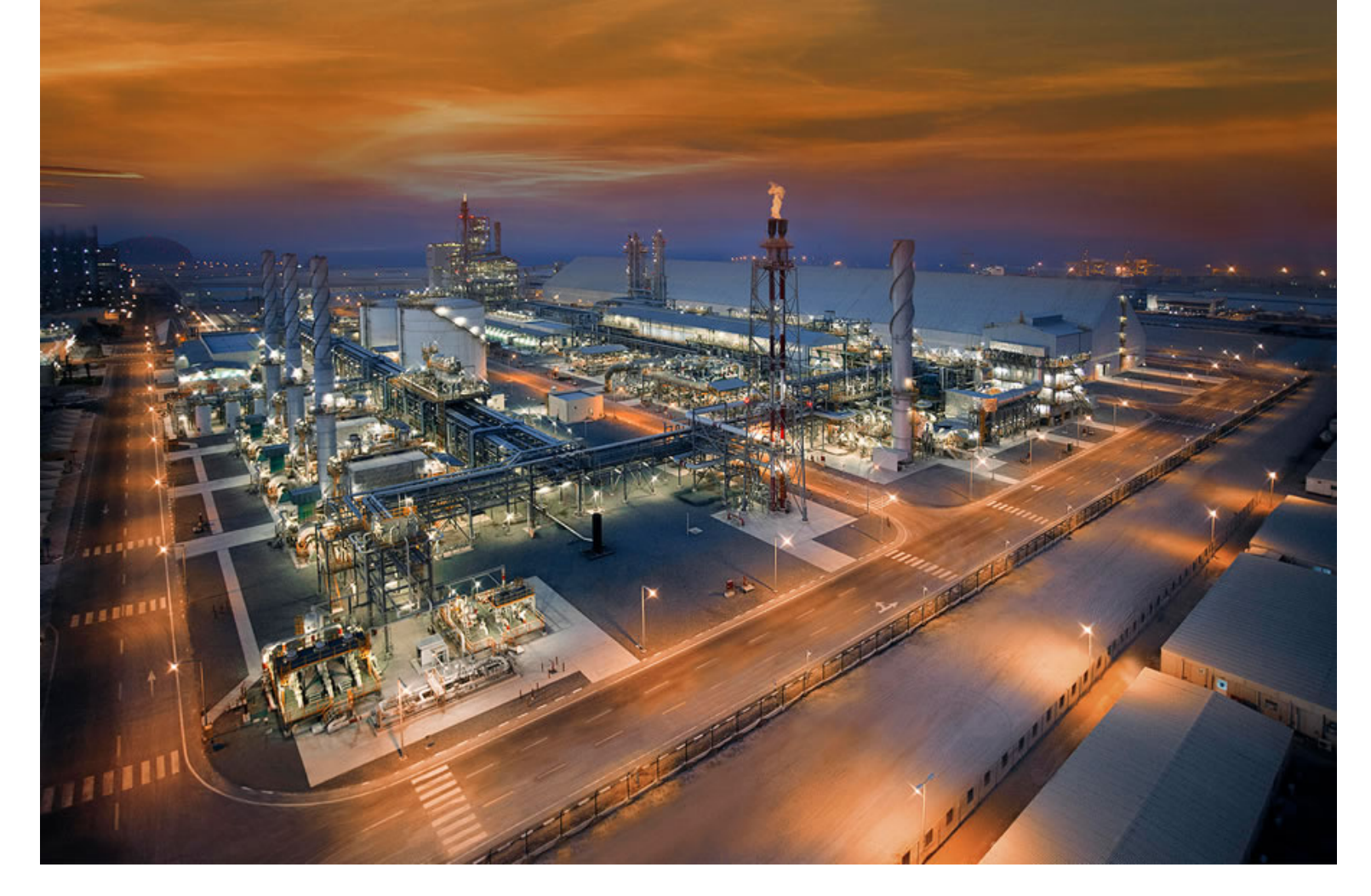
ADNOC used the technology to consolidate its 20 entities in the Middle East.

Legislative recognition is another step towards a stronger position of digital twins in the industry. As set out in the National Technology Initiative for the Removal of Administrative Barriers roadmap approved by the Russian Government, digital certification for products will be permitted from 2020.