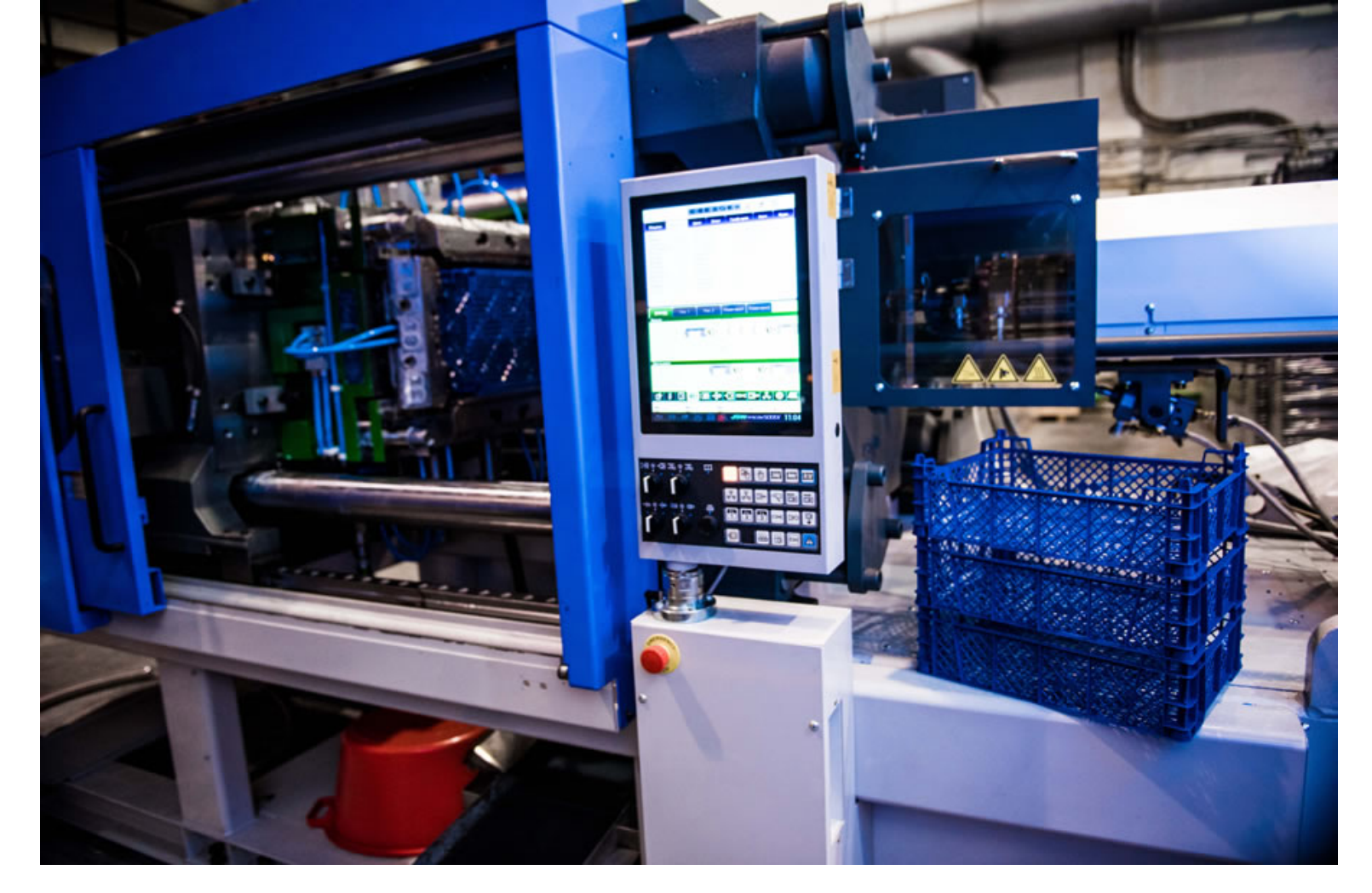
JSW J280ADS (injection moulding machine).