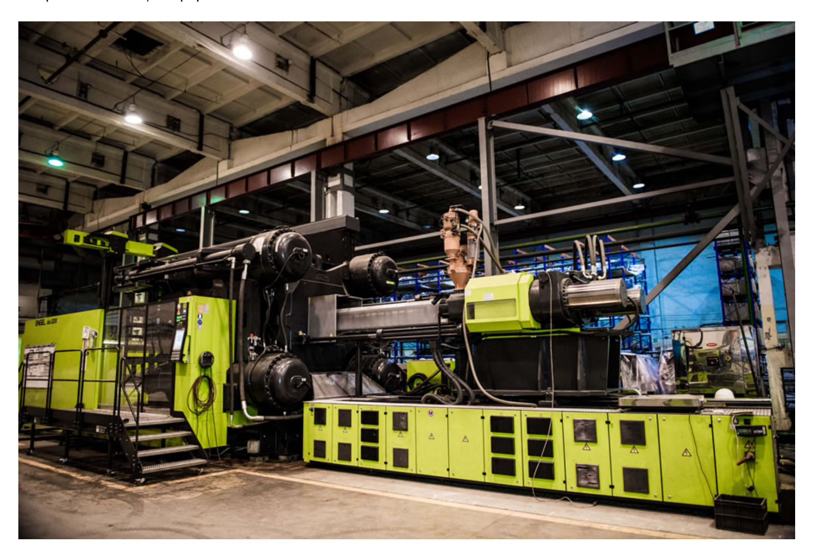
ENGEL duo 3200 (injection moulding machine for large parts).

addressing the latest challenges. Goods manufactured with the use of different technologies (e.g. extrusion, forming and different composite solutions) are popular in the market.