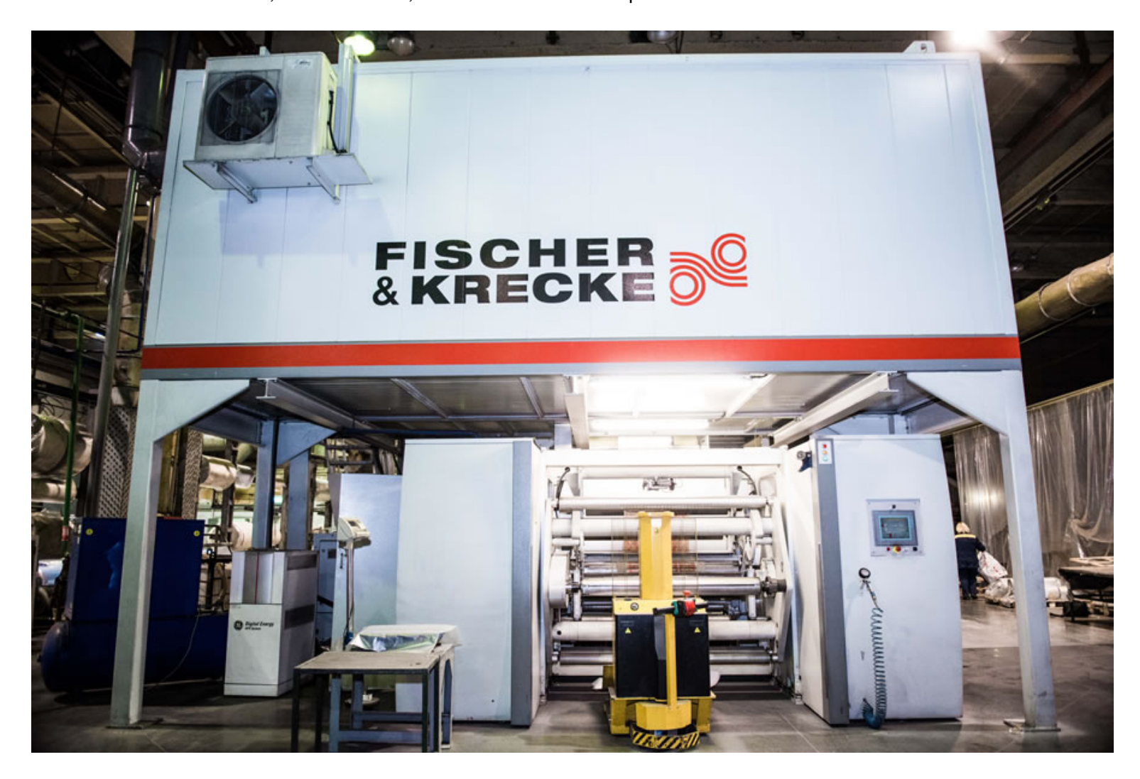
Fisher & Krecke (flexographic printer).

The use of natural gas is a major trend for the world's automotive industry. Compressed natural gas is a motor fuel that is second to none in terms of economic, environmental, resource and technical parameters.